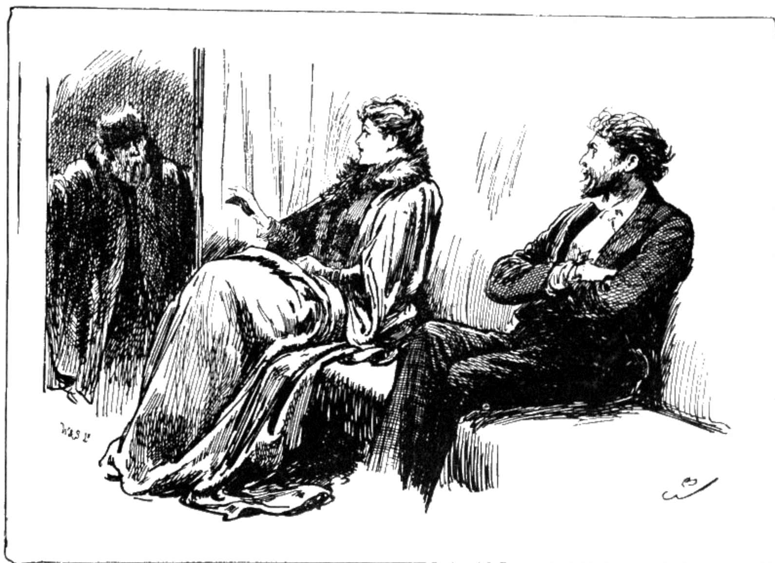
"GIVE ME YOUR CAP AND MANTLE."

And this man fell to sobbing ; then he arose, and went out staggering like a drunken man. That same evening I told the Countess that a stranger had been to