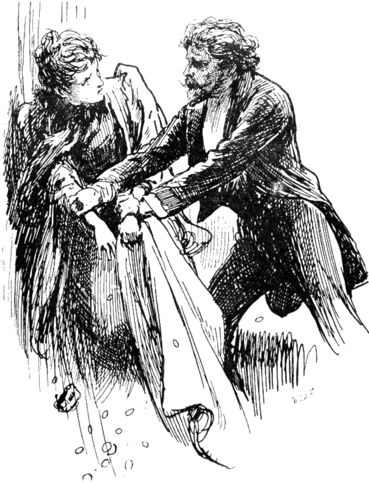
"HE SPRANG UP AND SEIZED HER."

The old servant, bewildered, took off his cap and mantle, with unquestioning obedience, accustomed to the sudden whims and