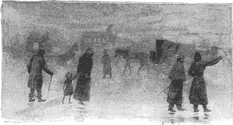
"THE FOG CAME DOWN UPON US."