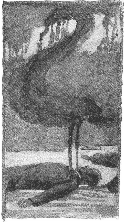
"CLOUDS OF BLACK SMOKE WERE POUKED FORTH."

Being an old man, I am, perhaps, a laggard who dwells in the past rather than the present ; still it seems to me that such an article as that which appeared recently in Blackwood from the talented pen of Pro-