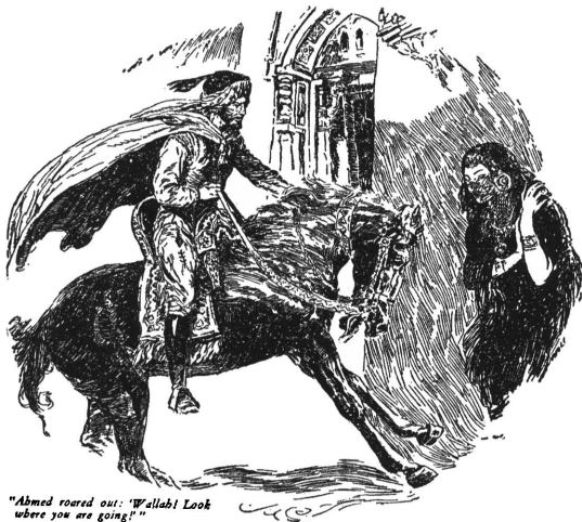
"Ahmed roared out: 'Wallah! Look where you are going!'"

concealing cloak from her shapely shoulders, the better to display her charms to prospective purchasers.