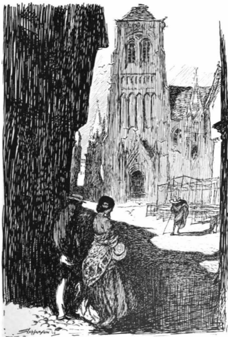
"The market-place was empty, the stalls were bare. Only one figure moved amongst them, the figure of a ragged pedlar."