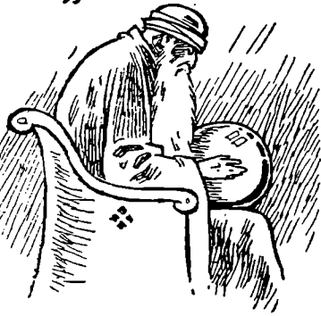
E. Hoffmann Price "With a hoarse, strangled yell, Isfendiyar leaped forward, wrenching himself from his vision. The simitar flamed wide and swiftly."

I SMAIL the chief wazir sat at the foot of his master's dais, reading from the chronicles of that great prince, the adornment of Islam, who had reigned magnificently in far-off Balkh nine hundred years ago.