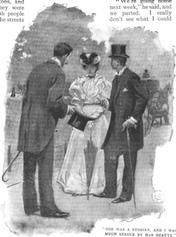
"SHE WAS A RUSSIAN, AND I WAS MUCH STRUCK BY HER BEAUTY."

"We're going home next week," he said, and we parted. I really don't see what I could