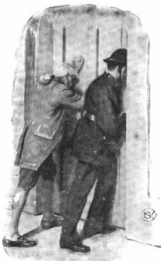
"THE POLICEMAN AND BUTLER TRIED TO BREAK IN THE STRONG OAK DOOR."

I hurried past the old fellow, and up the stairs to the oak room, a little panelled room with a strong oak door, which two men, a policeman and the footman, were trying to break in. From the room came a noise of blows and of a voice singing, heard from time to time, as the two men paused in their violent attack on the door. The voice was strange to me, and I could make nothing of the words of the song; they were not English, that was all I could