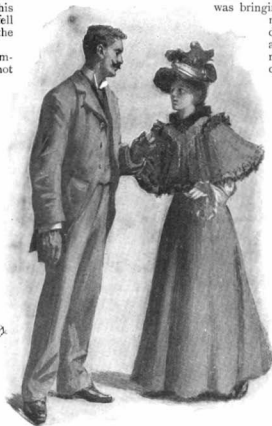
"MY HUSBAND HAS MET WITH A TERRIBLE ACCIDENT," SHE CRIED."

instantly commenced operations on Barton's arm, while his brother seized hold of his lodger round the waist. Mrs. Barton, her eyes still fixed on the big Jew, was crouching down at the end of the room, and I hurried round the bed only just in time to stop the man Israel, who rushed towards