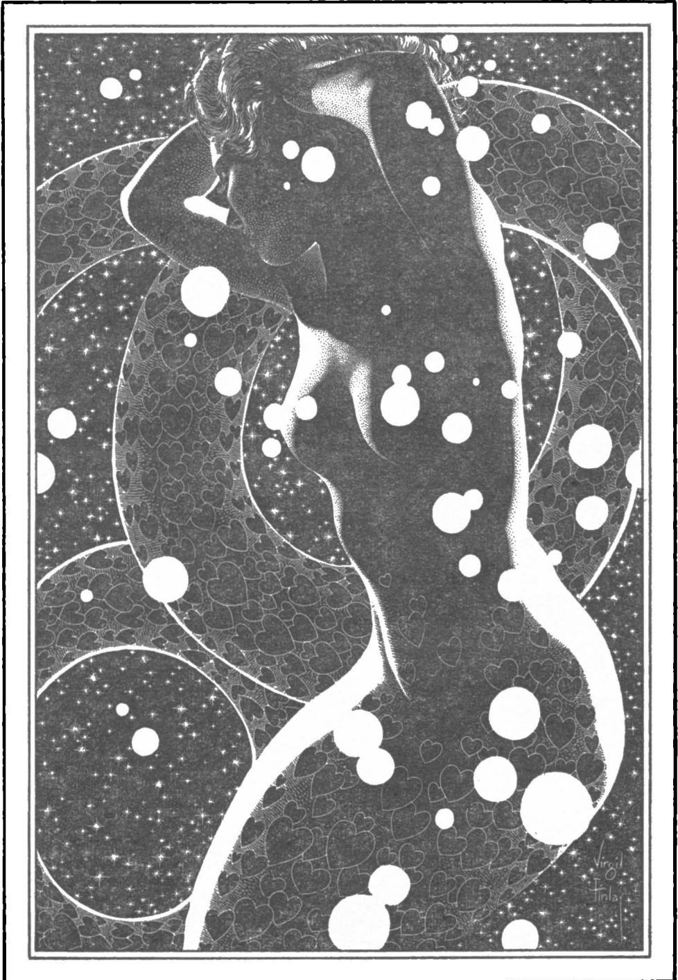
Beautiful she was though terrible—this serpent woman with hair of spun silver. . . .