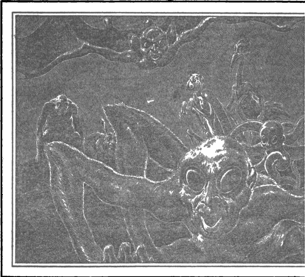
A whole new world of appalling grotesquerie—soulless spider men and spider women. . . .

master hand of science to awaken them, and having awakened, blend them with the shape of man?