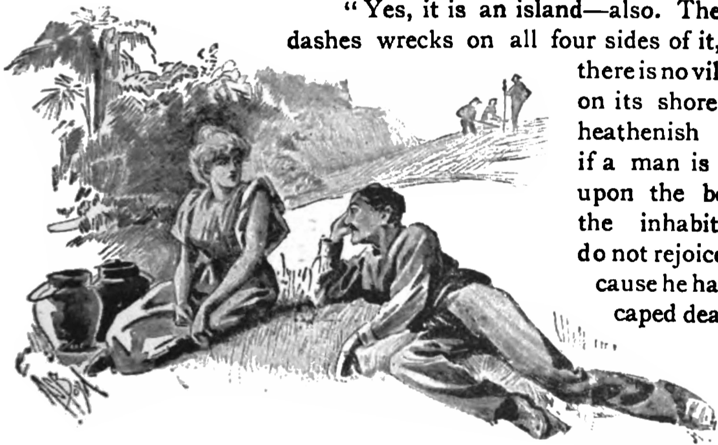
"SHE LIFTED HER EYES FOR ONE BRIEF MOMENT."

"Yes, it is an island—also. The sea dashes wrecks on all four sides of it, but there is no village on its shores so heathenish that if a man is cast upon the beach the inhabitants do not rejoice because he has escaped death."