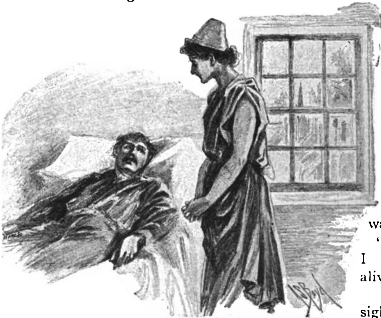
"A PLACID-FACED NURSE STOOD BY HIS BED."

Stanford closed his eyes wearily. "I am evidently insane," he said to himself. Then, losing faith in the reality of things, he lost consciousness as well, and when his senses came to him again he found himself lying on a bed in a clean but scantily furnished room. Through an open window came the roar of the sea, and the thunderous boom of the falling waves brought to his mind the experiences through which he had passed. The wreck and the struggle with the waves he knew to be real, but the episode on the beach he now believed to have been but a vision resulting from his condition.