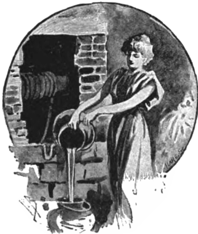
‘RUTH AT THE WELL.’

“It is more fitting,” said the man, coldly, “that you should receive instruction from me or from some of the elders than from one of the youngest in the community. When you are so far recovered as to be able to listen to an exposition of our views, I hope to be able to put forth such arguments as will con-