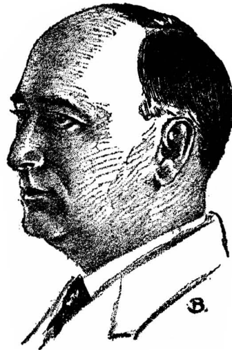
DAVID H. KELLER, M.D.

The next day Miss Martha Belzer seemed to be in her usual good humor. She was as capable as ever, in fact, the letters and reports that she dictated fairly sparkled with intelligent and shrewd con-