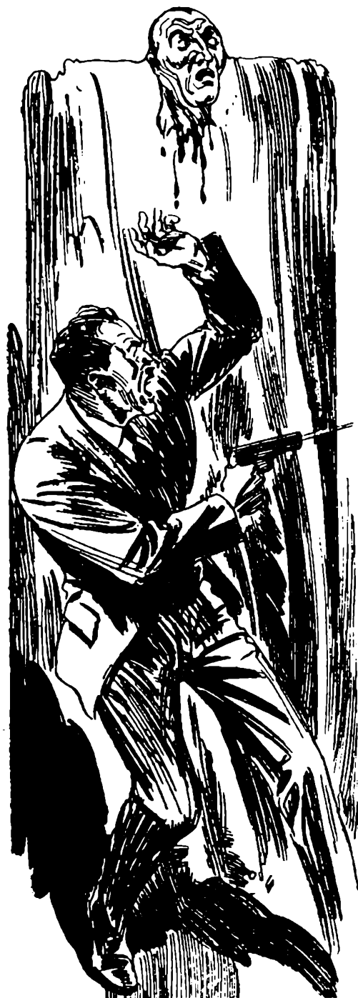
I swung, my finger on the trigger of the gun

I shoved the newspapers to the floor and stared out of the car window. It was a gloomy, overcast night. The train was winding slowly through wooded hills. Then it whistled, slackened and stopped. A small group of lights disclosed a wooden platform, a