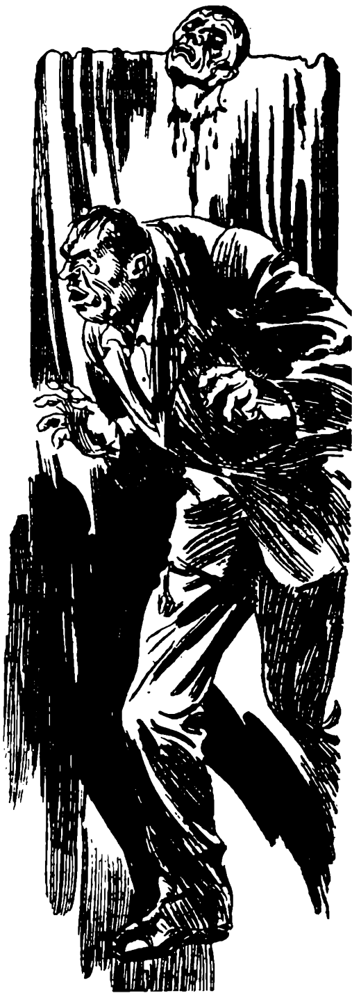
From the portières came a giant shape

"Oh, maybe thirty-five. Old man Morton was sixty-five. He got killed a week ago—"