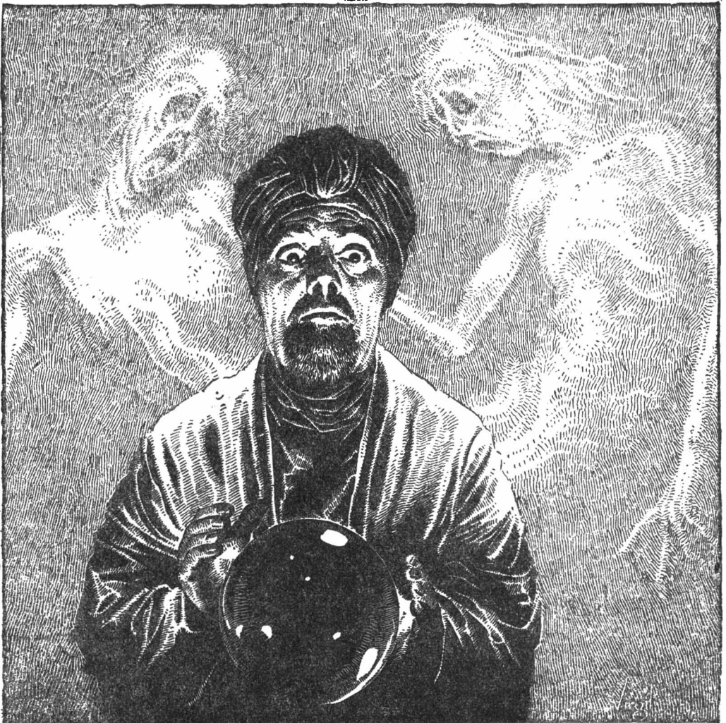
"He decided that the best protection against the Old Man would be to fight him with his own weapon—the occult."

ing at the huge, gold-handed Peter the First clock at the side of the room, "and we shall be again honored by the presence of our esteemed father. And who shall be the first he takes back with him? Certainly not me—the youngest. Probably you, Alexei," he grinned at me. "He always did hate you most. Ever fleeing him in your nice quiet way. Sneering. Laughing up your sleeve at him and his distemper. And then, too, you are the oldest of us. You're first in line. Boris, why don't you pray for him a bit? A religious cove