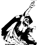
JULES VERNE'S TOMBSTONE AT AMIENS PORTRAYING HIS IMMORTALITY