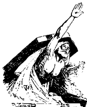
JULES VERNE'S TOMSTONE AT AMIENS PORTRAYING HIS IMMORTALITY