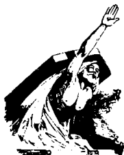
JULES VERNE'S TOMBSTONE AT ARÈNES PORTRAYING HIS IMMORTALITY