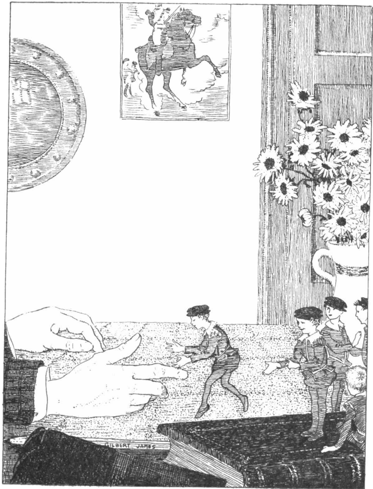
WAG INTRODUCES THE PARTY