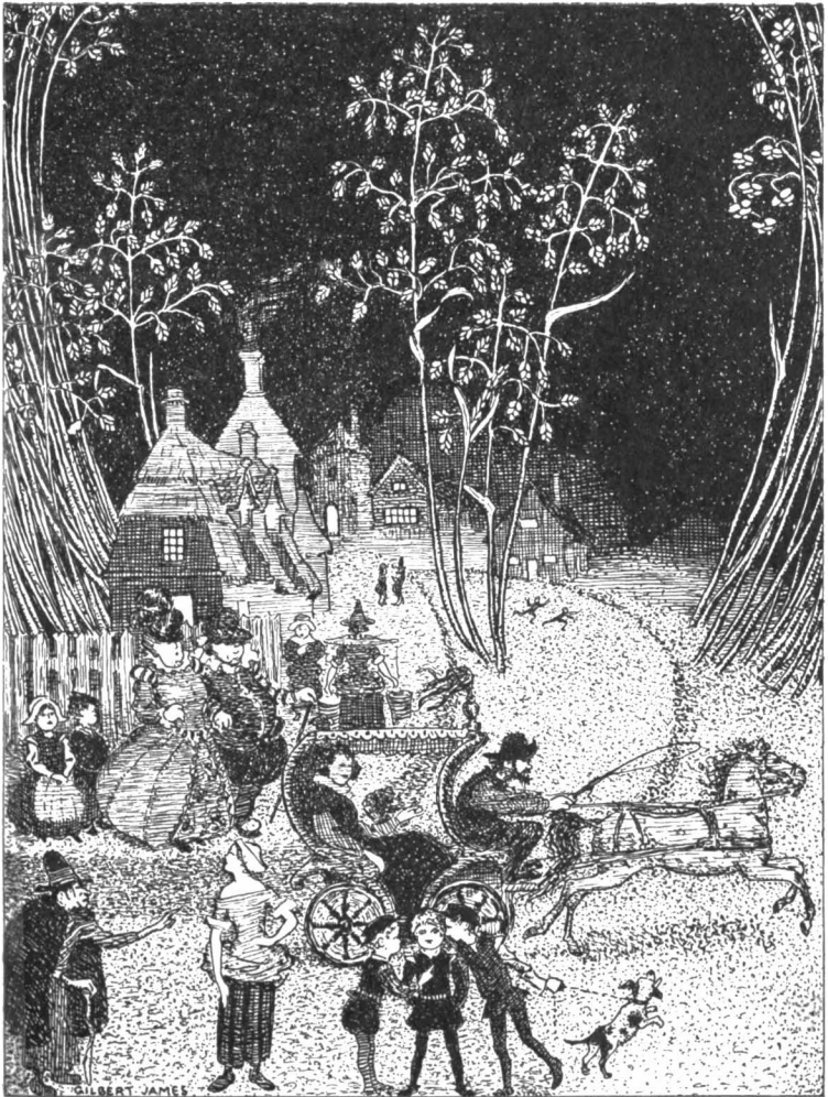
LIFE GOING ON MUCH AS USUAL