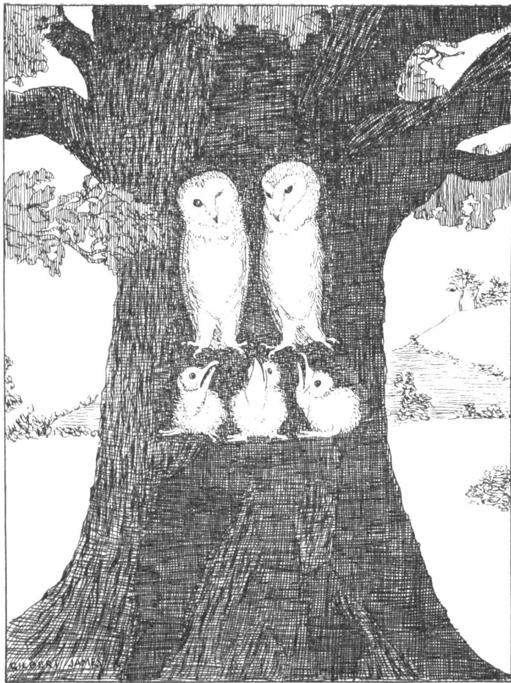
THE OWL FAMILY