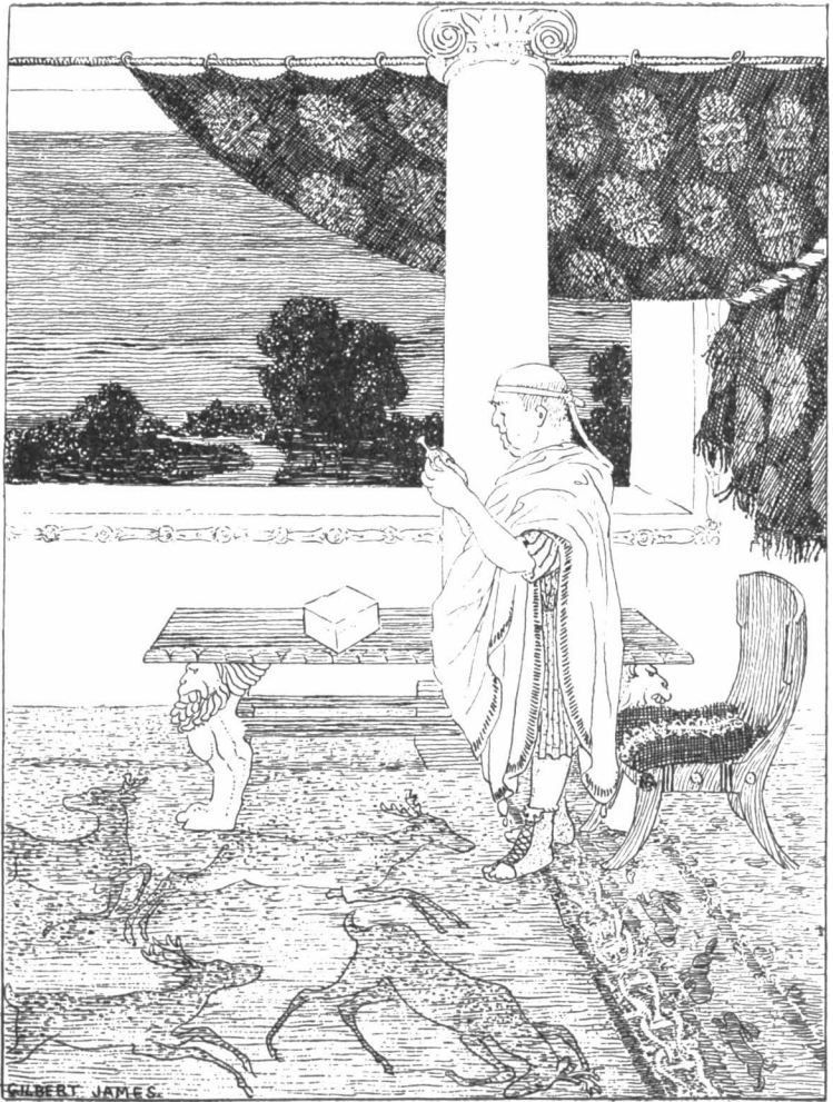
A FORMER OWNER OF THE JABS