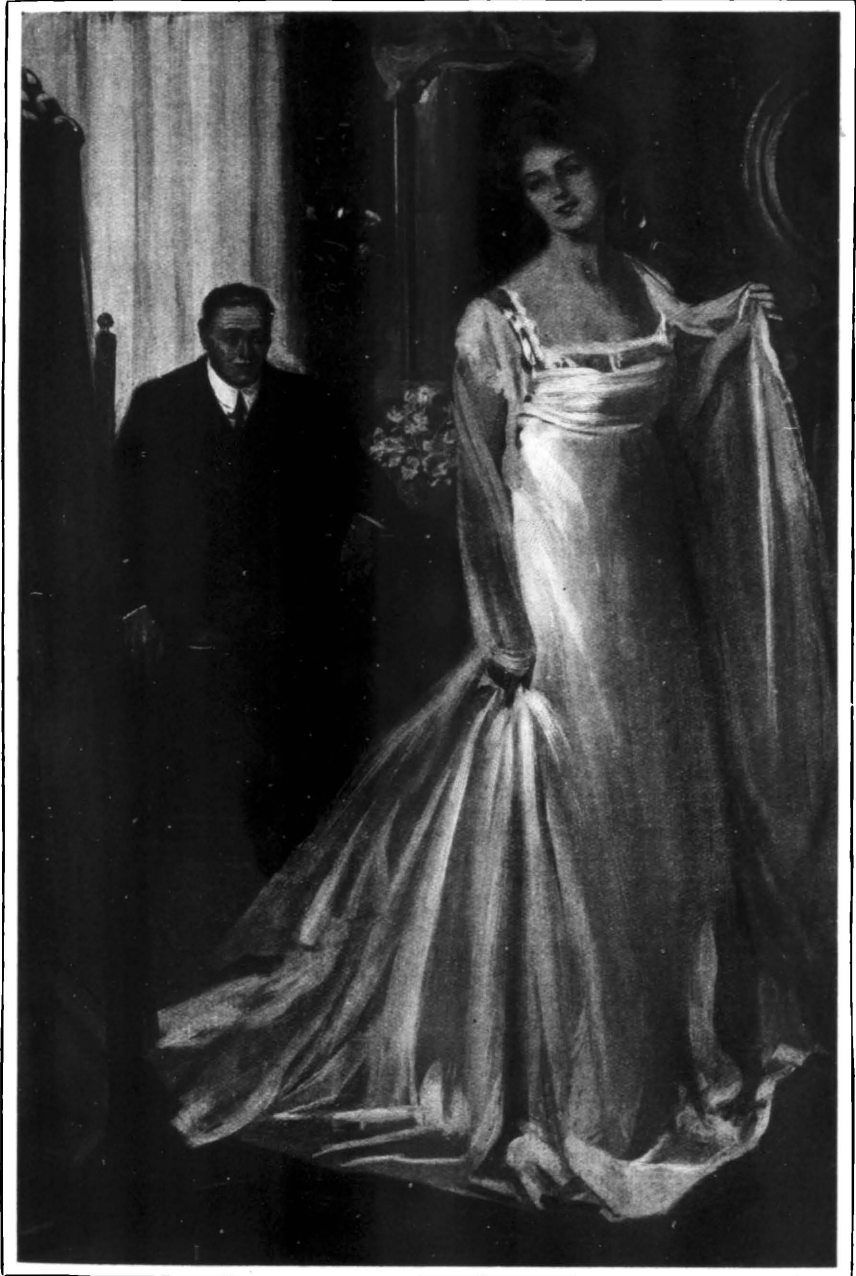
"Then I saw myself in the long mirror."