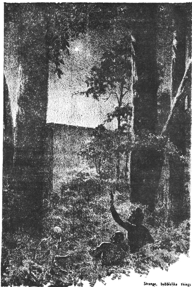
Strange, bubblelike things were bursting above. . . .