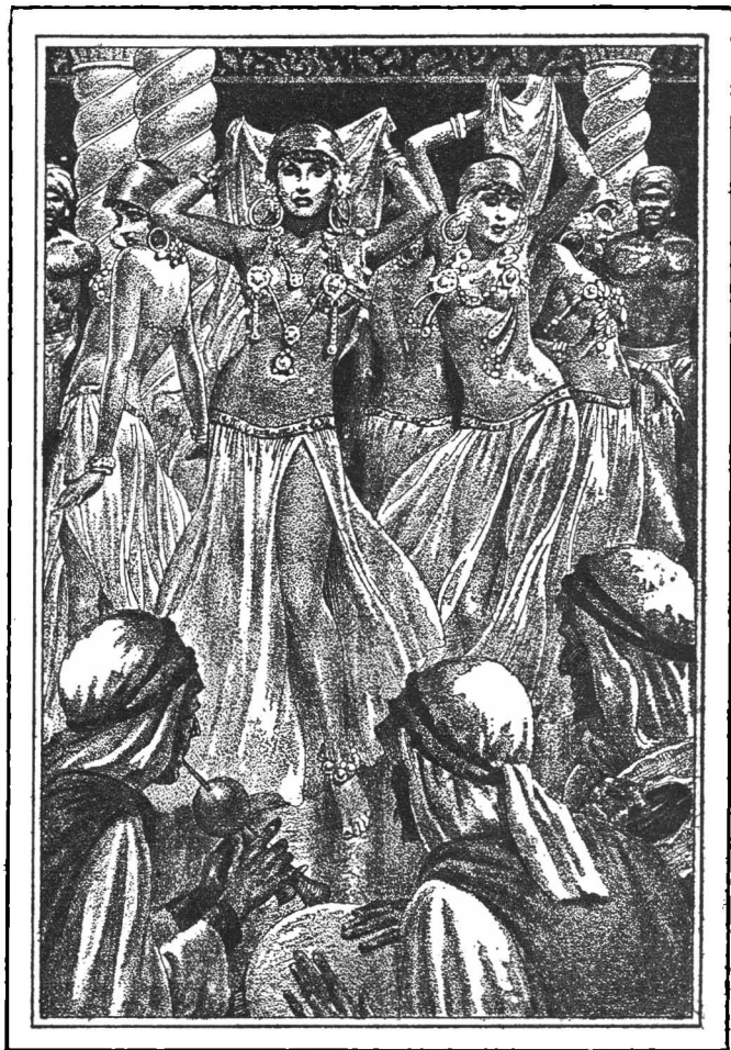
They swayed into sinuous beauty to the desert music.