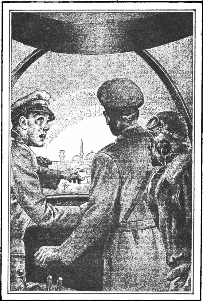
The Golden City