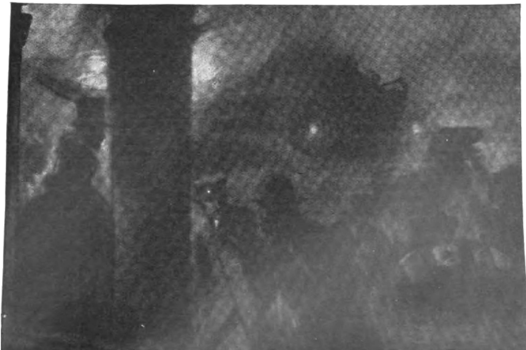
"CRABB PUT OUT HIS HAND AND TOUCHED BENTLEY."

"I'll give you a fiver if we get there all right," said Lord Gervase.