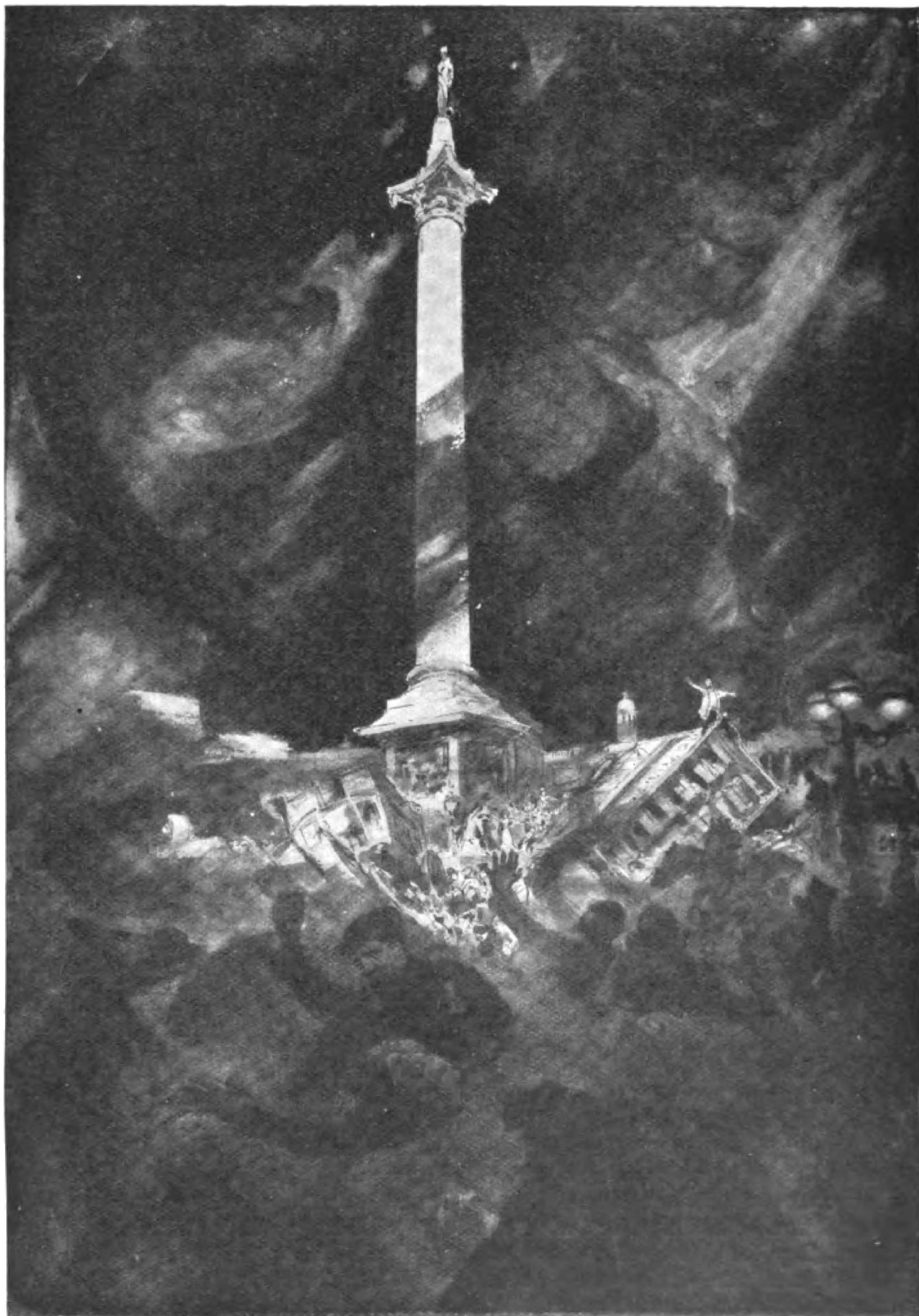
"SOMETHING BROKE IN THE FOG OVERHEAD, AND A GREAT LIGHT SHONE."

Lord Gervase, in a shaken voice. "Could we—could we use it? We must get Lady Semple out of this; we must, or she will die!"