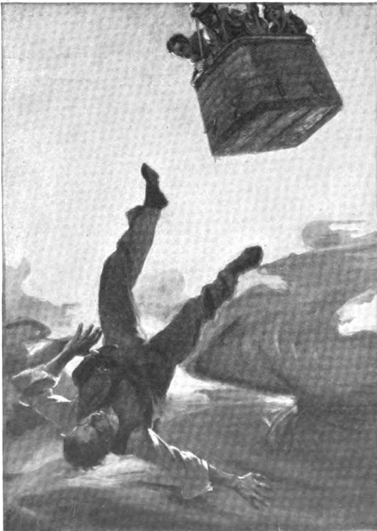
"HE FELL INTO THE CLOUD, BUT THE BALLOON ROSE AND ENTERED THE GREAT WIND OF THE UPPER AIR."

They saw his body fall, and Julia shrieked vainly. He fell into the cloud, but the balloon rose and entered the great wind of the upper air. And the heavy cloud below them slipped to the east.