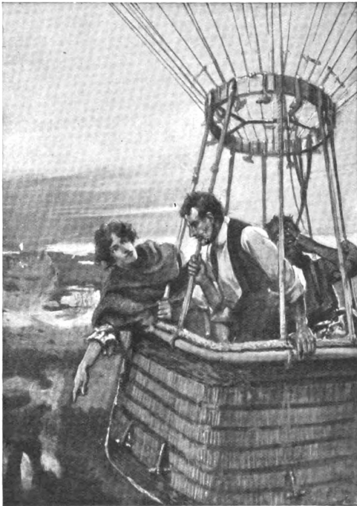
"'WHAT ARE THEY?' ASKED JULIA, POINTING INTO THE VOID."

As he waited he heard a little sharp cry like that of a bat, and then a sudden rushing sound, and the flat sound of something striking earth not many yards from him. It