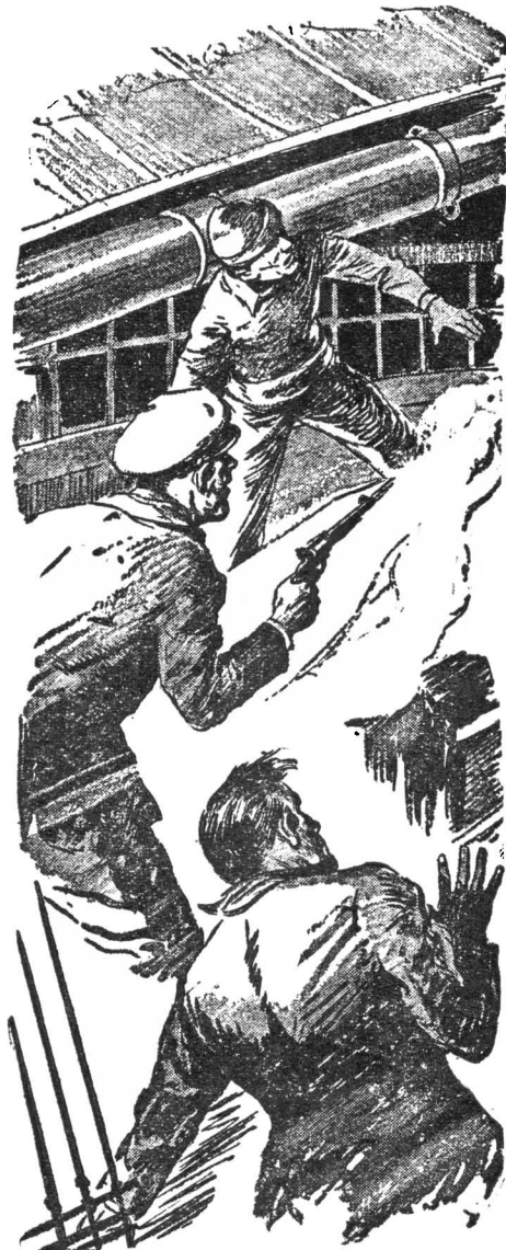
Next second the captain whipped

No, it wasn't the ship herself, as fine a hooker as ever I signed articles