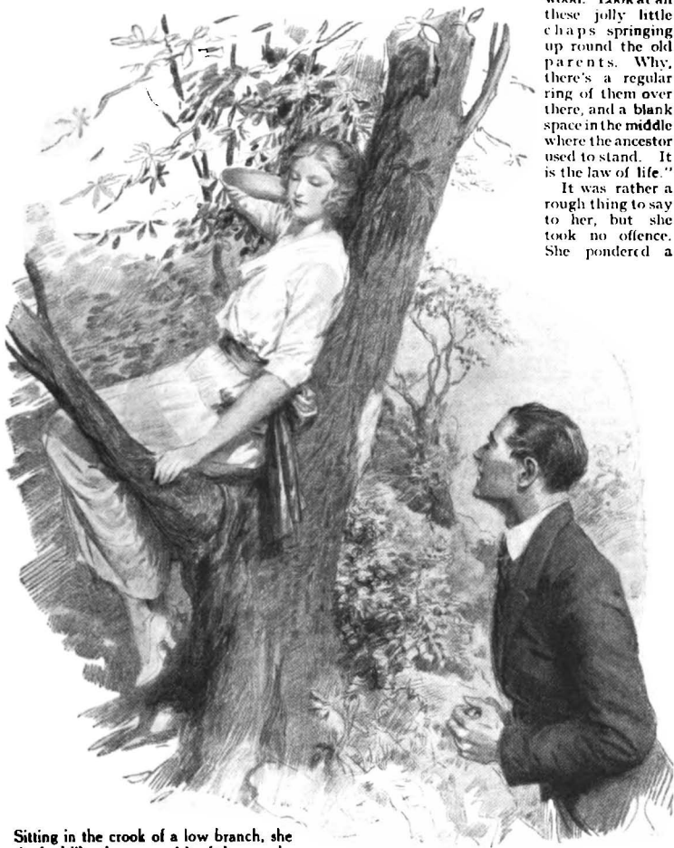
Sitting in the crook of a low branch, she looked like the very spirit of the wood.

It was rather a rough thing to say to her, but she took no offence. She pondered a