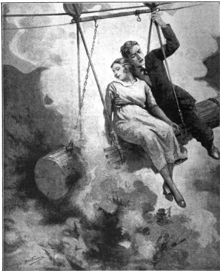
Beltony's hands shot off the rounded surface of the log, and he was gone! Looking down,

Nothingness, and within I heard a cool whispering of peace ineffable. Yet I would not enter, because I felt—I knew—that Esterdine was close beside me, waiting, watching. It was a test—that also I knew—and all the torments of hell should not make me fail!