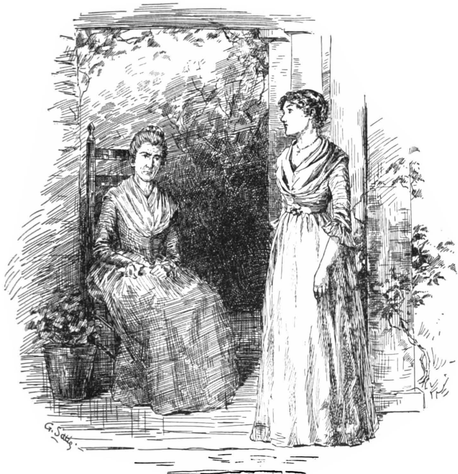
"The nervous fingers wavered, then fell despairingly."

ingly across a white face among the leaves, with eyes of wasted fire.