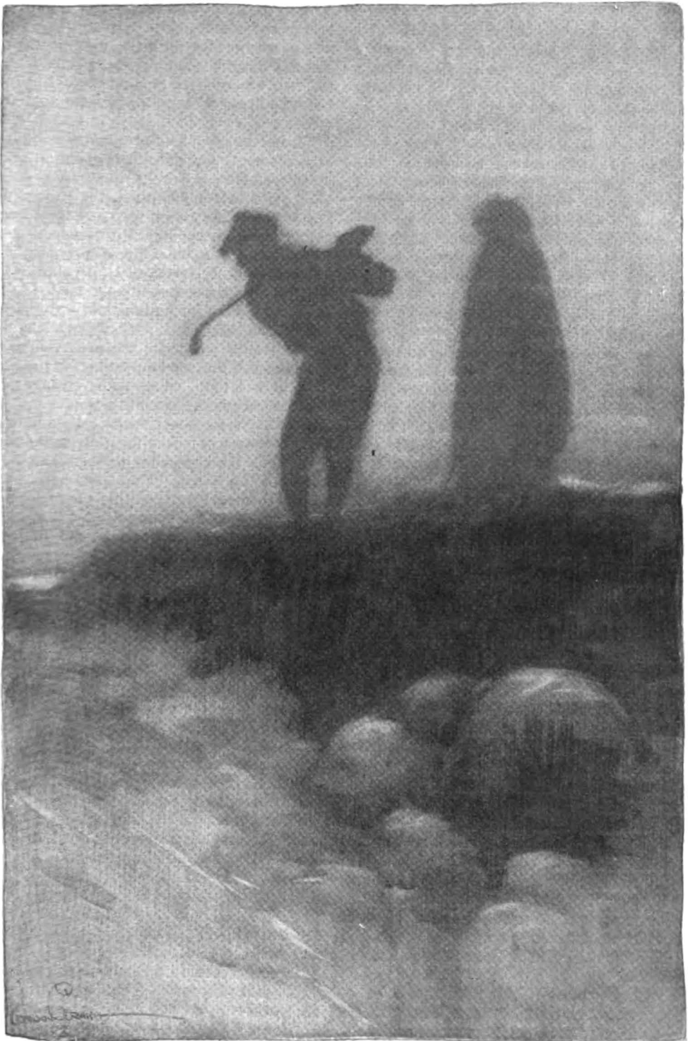
A FULL CLEAN SWING . . . BUT THERE WAS NO SOUND