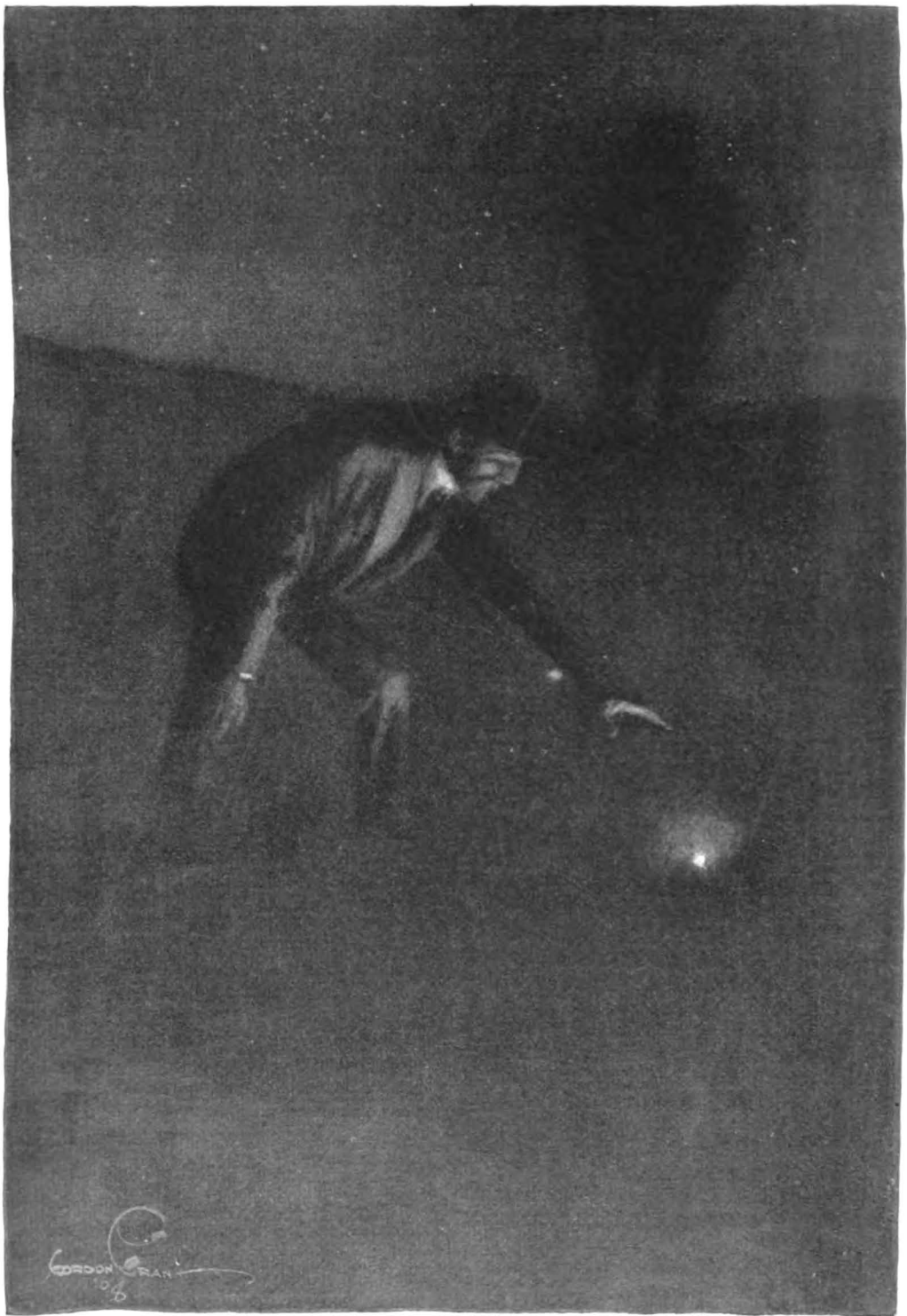
HARTLEY COULD SEE THAT HE STOOPED AS THOUGH HOPING TO CATCH IT IN HIS HANDS