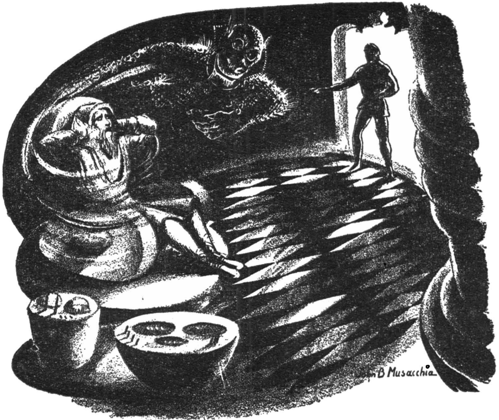
Here was a man in grave trouble, who needed help . . .

ity upon shoulders totally untrained to bear such responsibility.