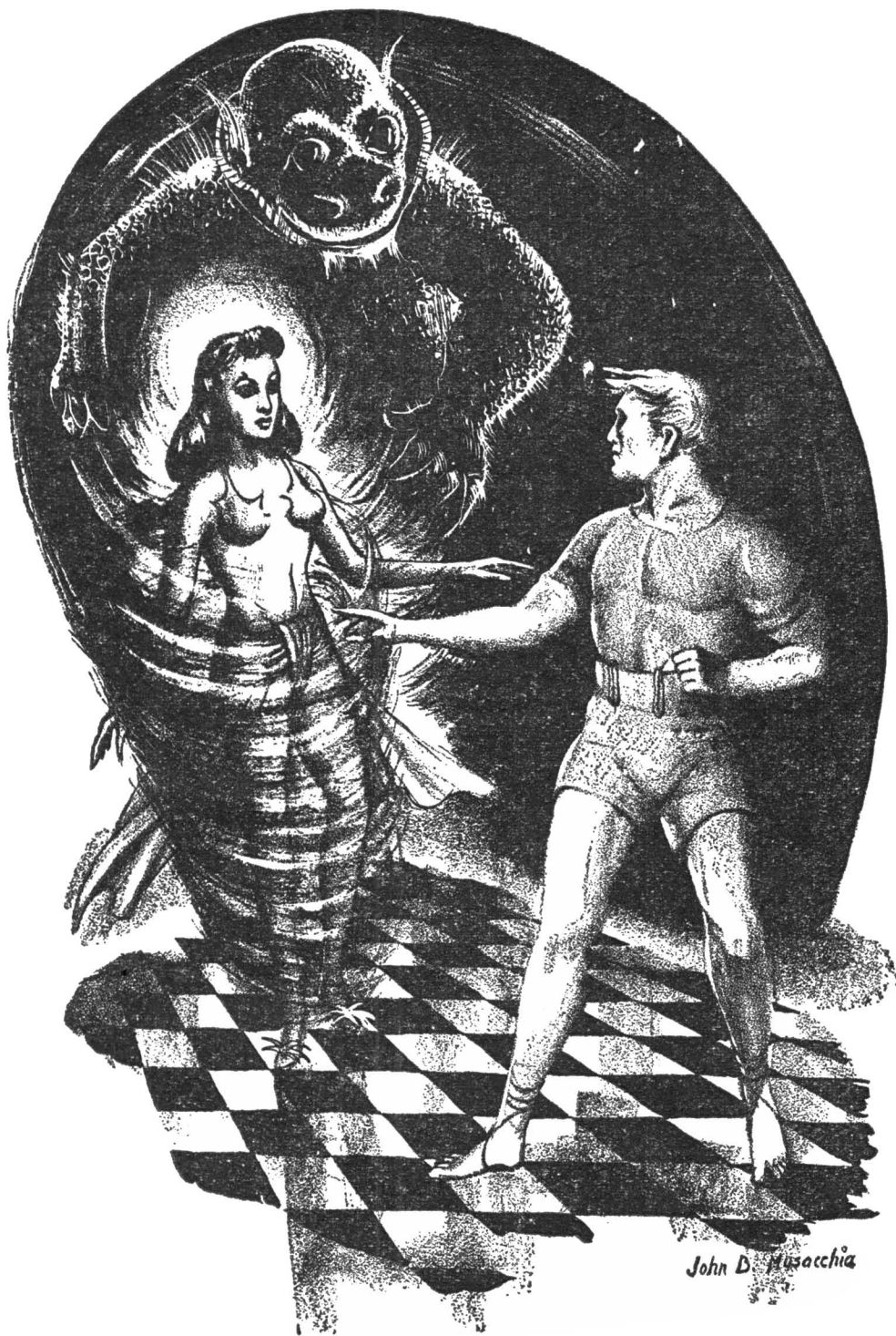
There seemed to be two persons within the casement of Deema Moray.