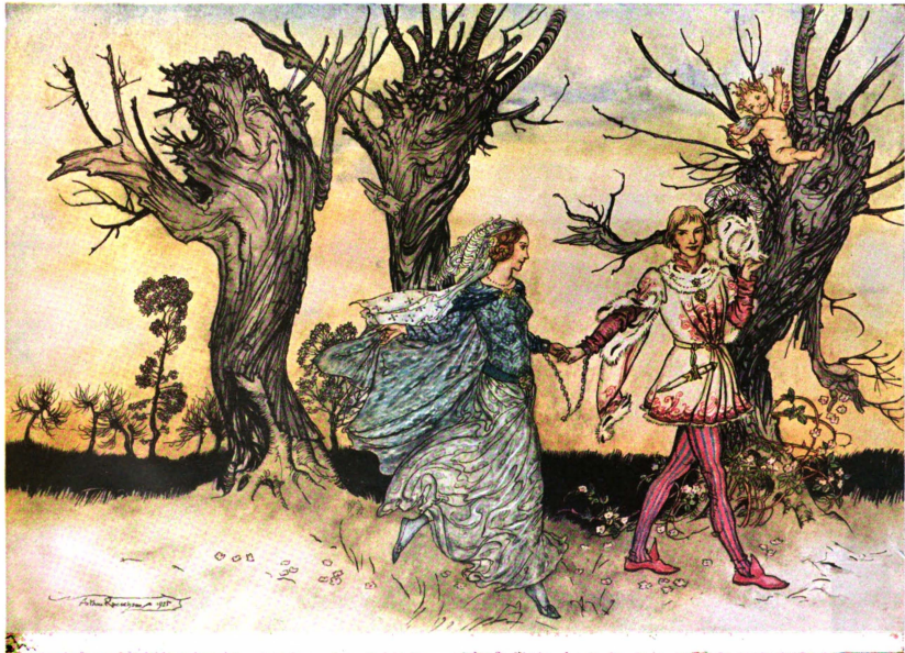
"PERHAPS AS LOVERS," SAID PERIVALE GENTLY. "FOR THAT IS AGAIN TO BE KING AND QUEEN"