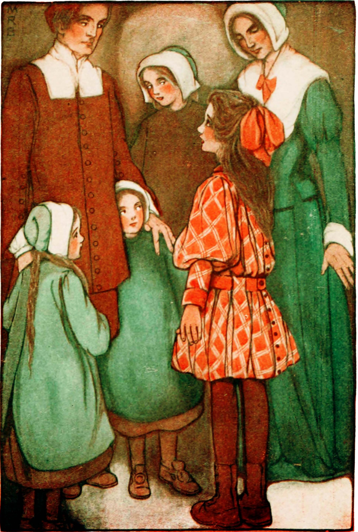
LETITIA STARED UP IN THE FACES, ALL STARING WONDERINGLY AT HER