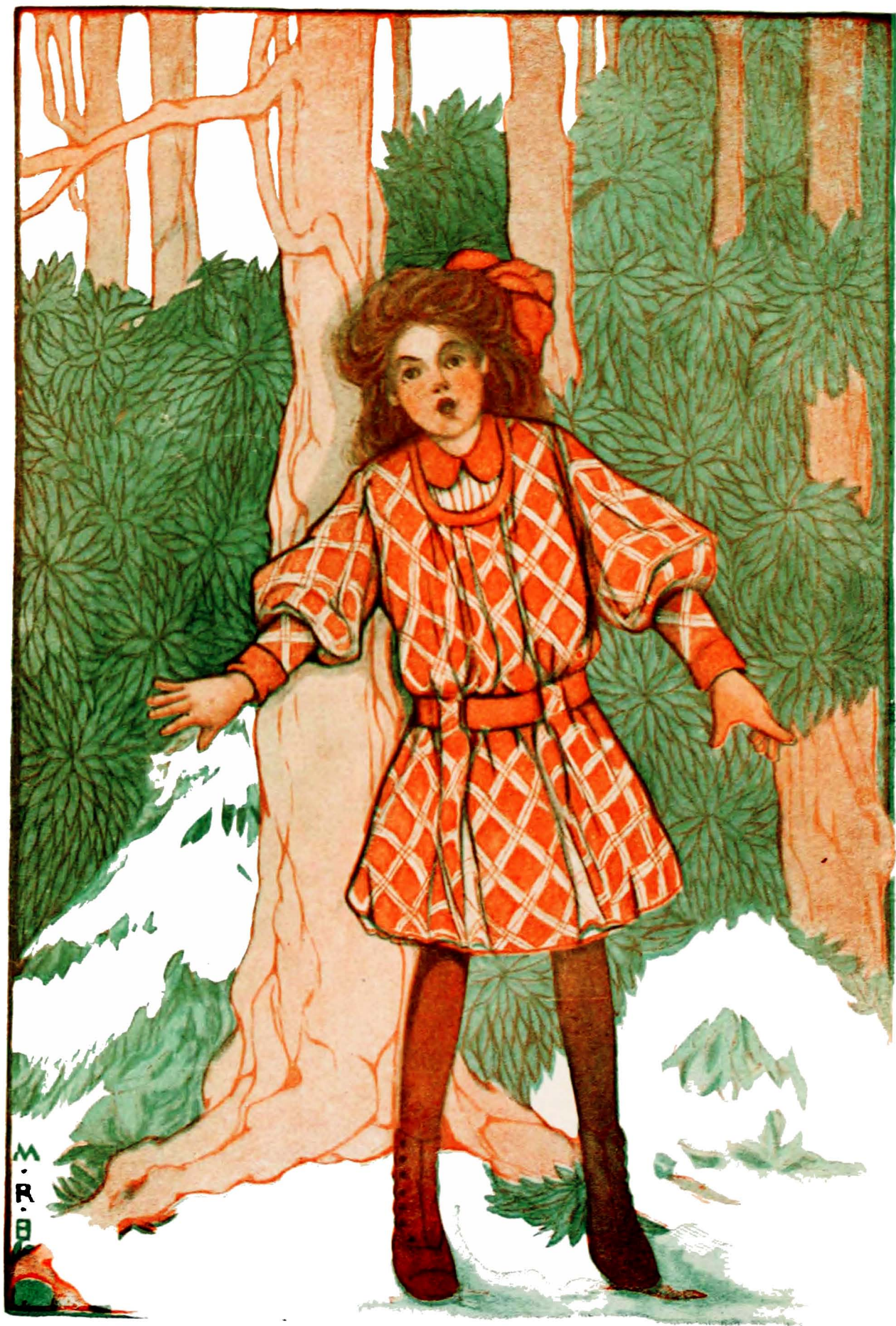
SHE WAS IN THE MIDST OF A GLOOMY FOREST OF TREES