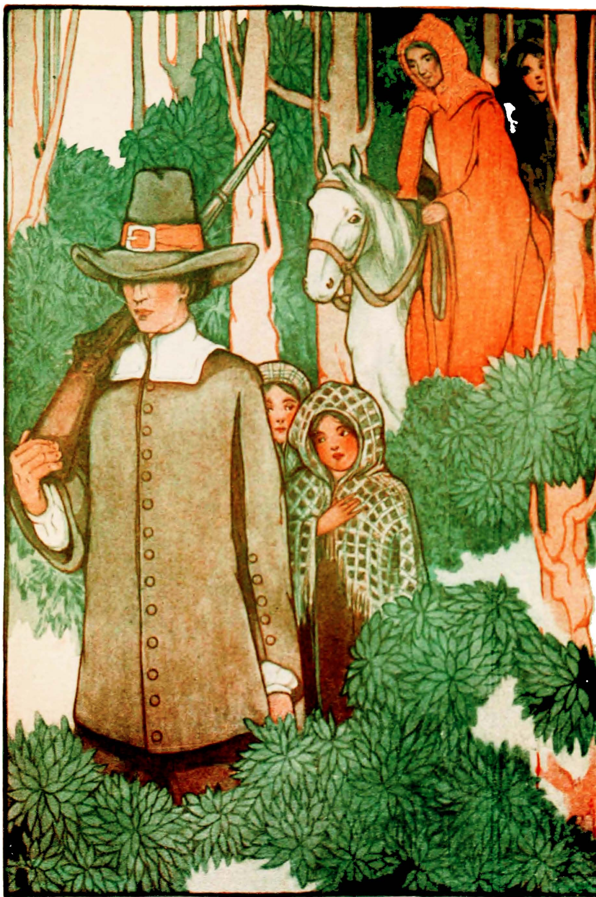
GOODWIFE HOPKINS RODE THE GRAY HORSE AND THE GIRLS RODE BY TURNS