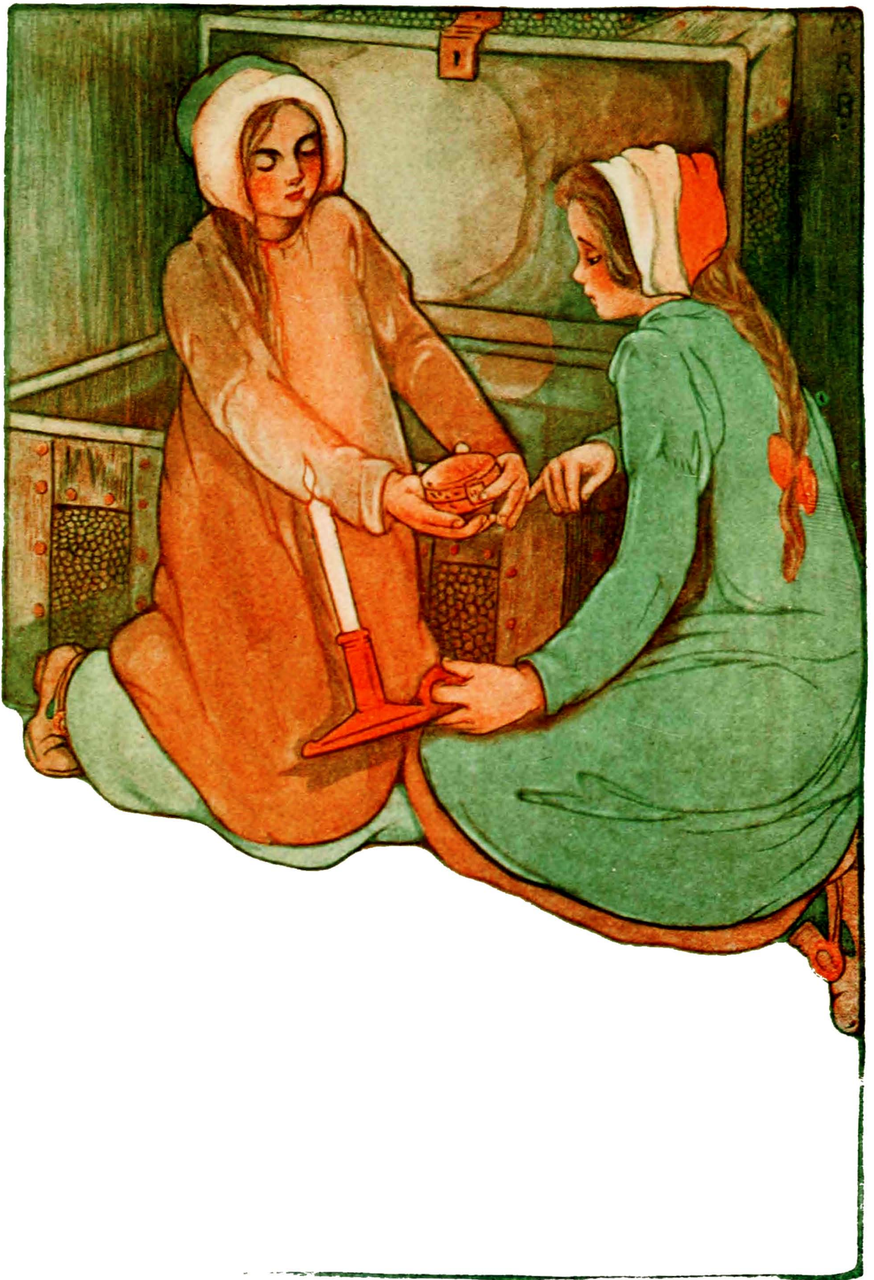
SHE SHOWED LETITIA HER TREASURES