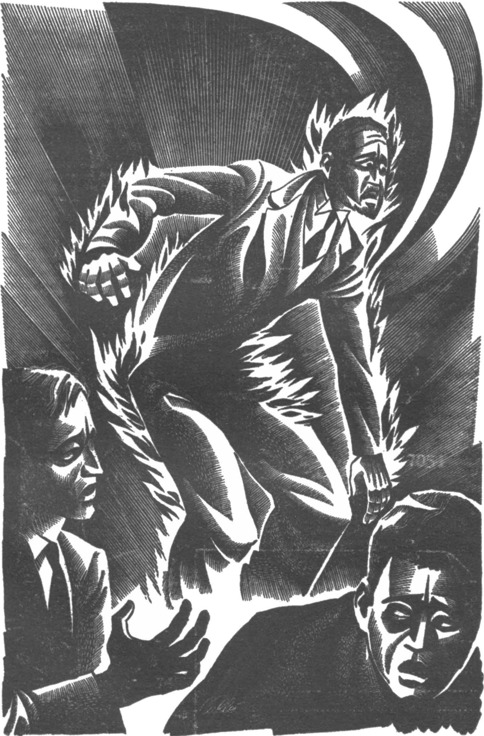
Jade green fire lighted for one horrific second the fear that distended the pupils of his eyes.