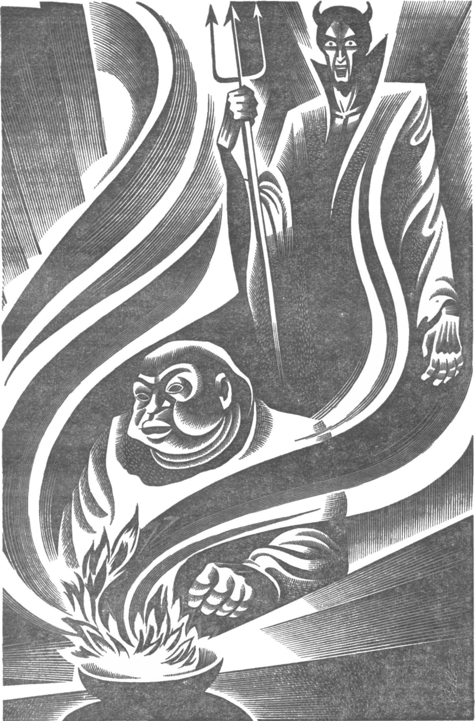
Toad reeked of insane egotism. Satan, his master, knew the satisfaction such a distinction might afford him.