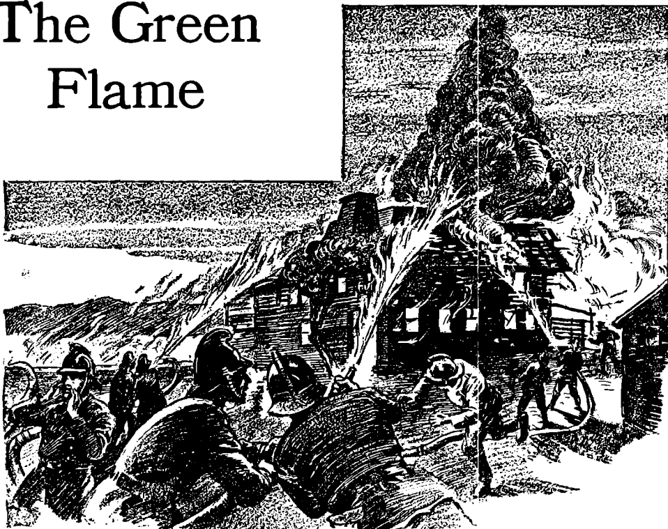
A strange cone of smoke hovered over the house. From the firemen's hoses came dreadful living flame