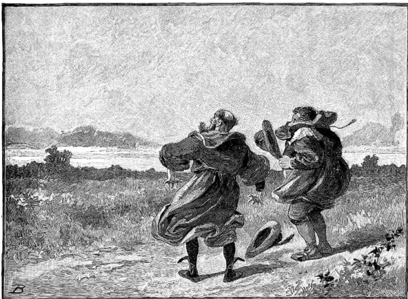
"THE GRIFFIN'S APPEARANCE IN THE AIR CREATED GREAT CONSTERNATION."

"What could I do?" cried the young man. "If I should not bring him he would come him-