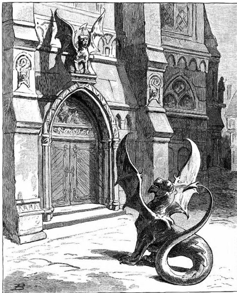
"THE GRIFFIN SETTLED DOWN BEFORE THE CHURCH AND GAZED EARNESTLY AT HIS SCULPTURED LIKENESS."

"Well," said the Griffin, as soon as the young man came near, "I am glad to see that there is some one who has the courage to come to me."