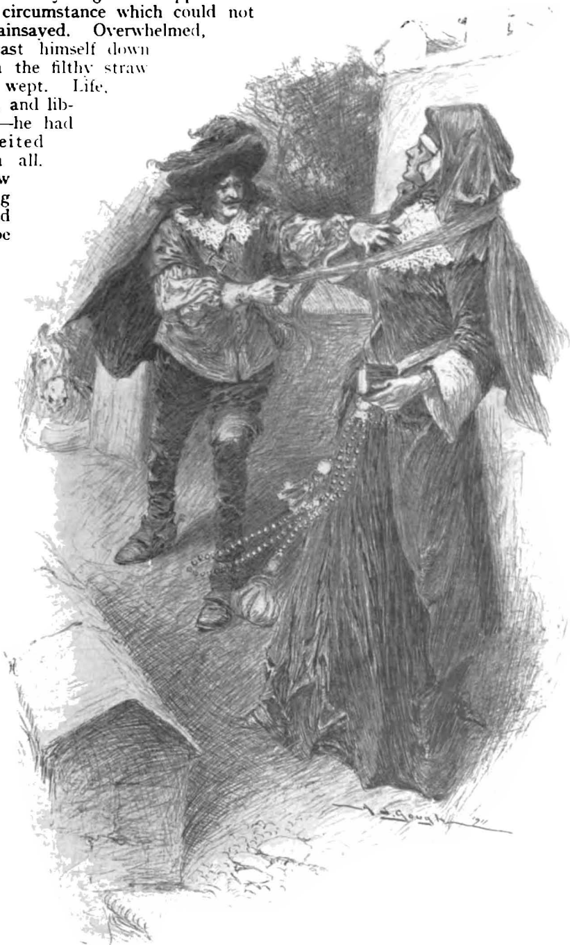
"The whip-like coils of Elspeth Halmer's hair shot forth and encircled the slender neck."

ere the vengeful witch in the next room had woven that wonderful hair into the halter that was to strangle