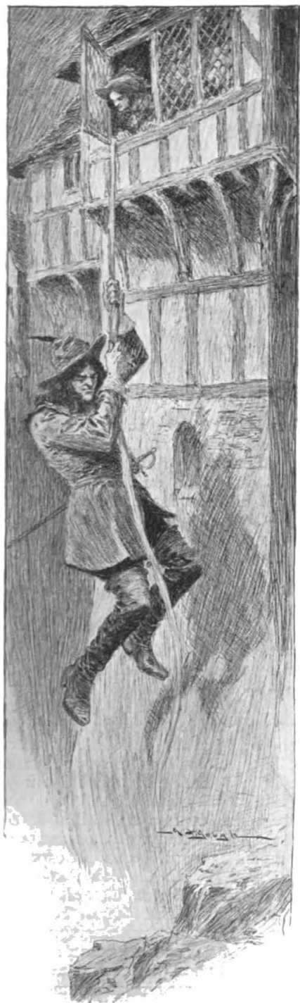
"Swiftly he descended, fearing the strands might part."

"I do not want him to suffer, grandam," muttered the girl sullenly, looking away.