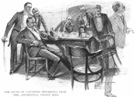
THE SOUND OF LAUGHTER PROCEEDING FROM THE, APPARENTLY, VACANT SEAT.

"I have been calculating the difference between Cingalese and Greenwich time. It must have been between three and four o'clock when the servant went running to say that Geoff's body was not upon the bed,—it was about that time that Lanyon died."