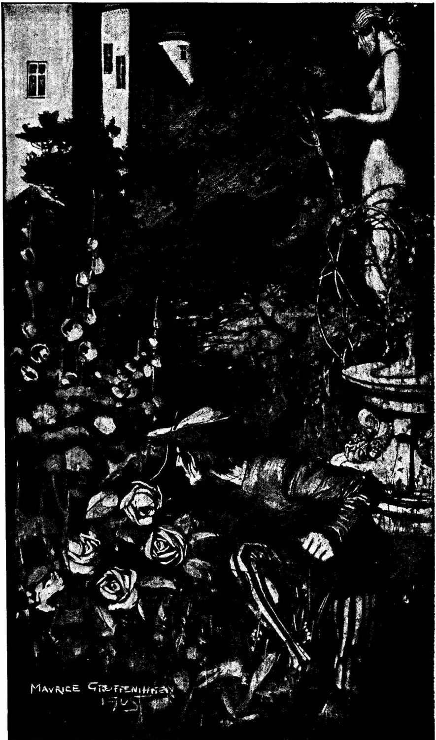
“The moon struck a pale fire from the face of the house and from the marble limbs of the statues.”