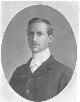
THE AUTHOR OF "THE BOOK OF WONDER", LORD DUNSANY.

Lord Dunsany is the eighth Baron of a creation dating from 1420. He was born in July 1878, and was educated at Eton and at the Royal Military College, Sandhurst. Formerly a Lieutenant in the Coldstream Guards, he saw active service at the battles of Belmont, Graspan, Modder River, and Magerfontein. In 1904 he married Lady Beatrice Child Villiers, daughter of the seventh Earl of Jersey. His works include "The Gods of Pegana," "Time and the Gods," "The Sword of Welleran," and "A Dreamer's Tale."