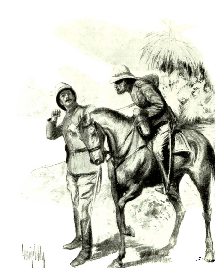
"By the Singing River and the Jantit Palms"

"Sir Arthur St. Clare was a soldier of the old religious type—the type that saved us during the Mutiny," continued Brown. "He was always more for duty than for