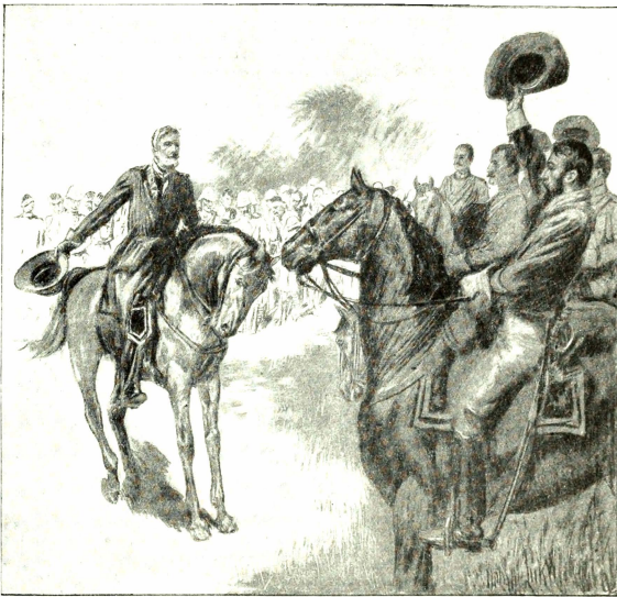
"He is Saying Farewell to the Great Enemy"

"I couldn't," said the priest with regret. "There's a great marble monument on top of it: a monument to the