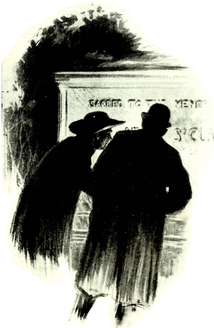
The Black Letters Which So Many Americans Had Reverently Read

So faint was that frigid starlight that nothing could have been traced about them except that, though they both wore black, one man was enormously big, and the other—perhaps by contrast—almost startlingly small. They went up to the great graven tomb of the historic warrior and stood for a few minutes, staring at it. There was no human, perhaps no living, thing for a wide circle; and a morbid fancy might well have wondered if they were human themselves. In any case, the beginning of their conversation might have seemed strange. After the first silence the small man said to the other: "Where does a wise man hide a pebble?"