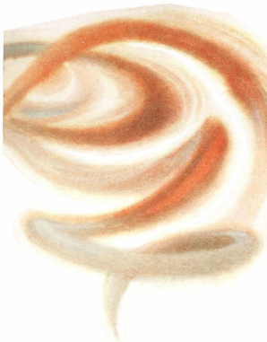
MISS PYLIC CLOUD

"As they watched in wonder, the vague shape hovered and whirled."