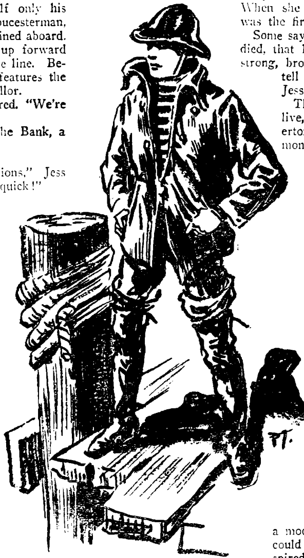
Sonny was only a boy when his daddy took him to sea. No one could have foreseen the weird drama that lay ahead

And the answer to it was ever a mooted one, although most agreed it could be traced to a premonition inspired by a knowledge of her condition. Perhaps Jess himself would not have answered differently.