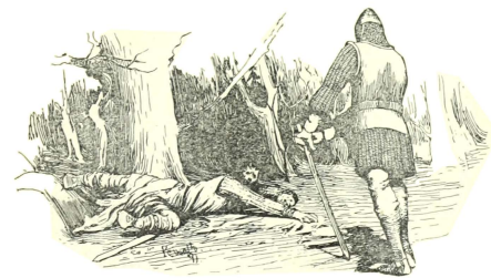
YÉRES WAS IN THE DEATH AGONY.

The old Touraine castle fluttered with bandelets and streamers from battlement to base. There had been tourneying in the outer court, hawking upon the glacis , archery and yeoman sports in the barbacan, ring-riding and lance practice in the plain just beyond the moat, tennis and jeux de paume in the grande-salle , and to crown all a monster game of chess in which the pieces were the living men-at-arms of the Court of Sainte Edme, apparelled and mounted as Knight, Bishop, an King and maneuvered by command of the concealing plot, stationed in the flanking towers of the castle wall. And there after the gigantic flash in the banquet hall, where the principal dishes were brought in to the sound of the trumpet by Knights