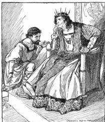
"INNOCENT PEOPLE," SAYS CONAL, "ARE BEGINNIN' TO THINK YOU ARE RAILLY TIED TO YOUR WIFE'S APRON-STRINGS."

tiddle his thumbs unless she showed him, and daren't do it without her consent, even if he knew. "Innocent people," says Conal, says he, "are beginnin' to believe these liars, and to think you are railly tied to your wife's apron-strings. And everybody who knows you, and knows your wonderful wisdom, is heartily sorry that such things is gettin' out; and they're sayin' that it's your due to show up these liars for what they are."