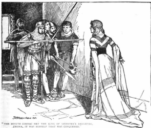
"THE MINUTE CORMAC MET THE KING OF LEINSTER'S DAUGHTER, CRIONA, IT WAS HIMSELF THAT WAS CONQUERED."