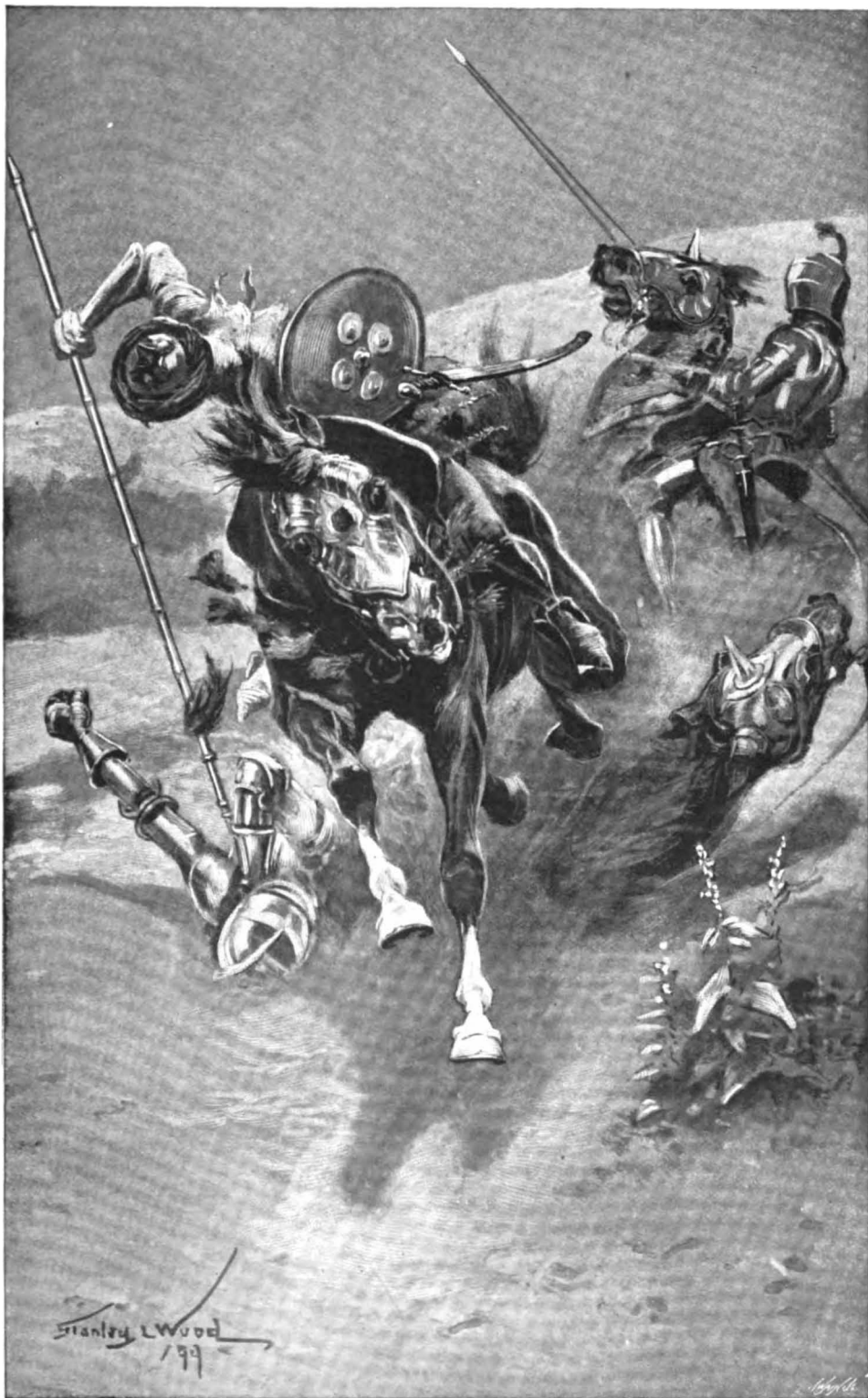
Horse and knight, in piteous plight, Roll headlong in the dust.