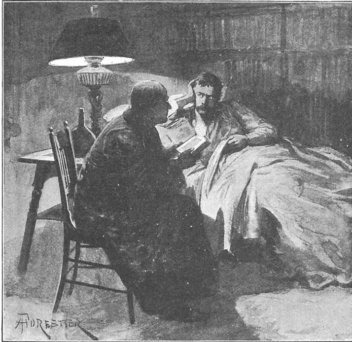
"IT IS INTERESTING," SAID I, "BUT NOT CONVINCING."

"She gazed without wincing upon the wooden horse and rings which had twisted so