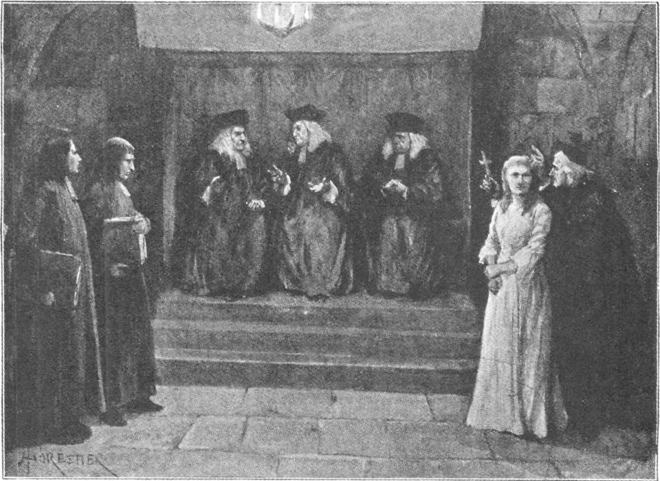
"BESIDE HER STOOD A THIN, EAGER PRIEST, WHO WHISPERED IN HER EAR."

When the room had been cleared there appeared a new figure upon the scene. This was a tall, thin person clad in black, with a gaunt and austere face. The aspect of the man made me shudder. His clothes were all shining with grease and mottled with