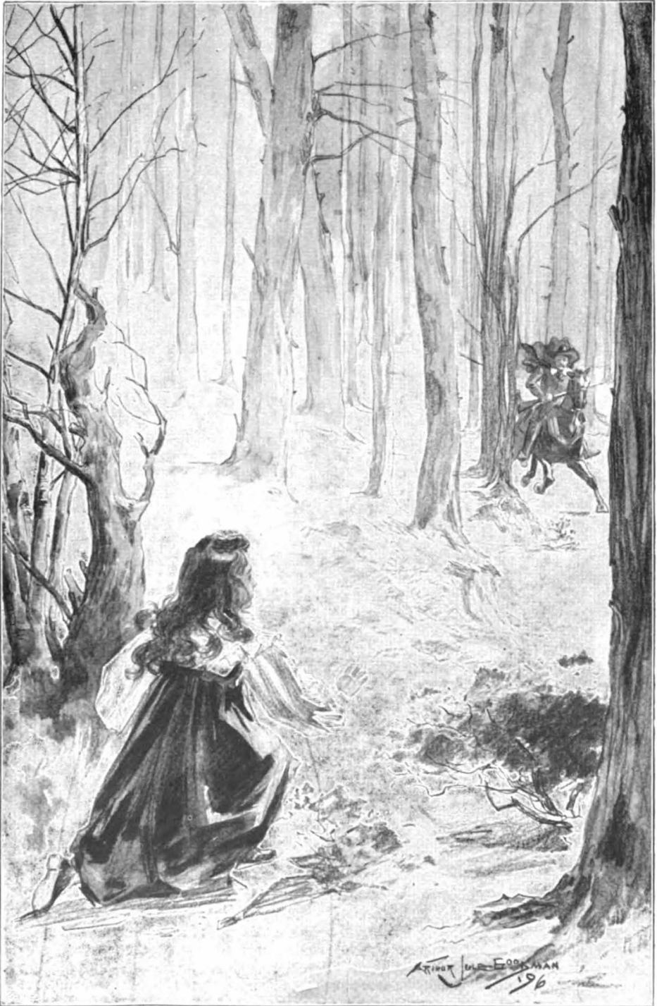
A MAN WITH A WIDE CAPE FLYING BACK LIKE BLACK WINGS CAME RUSHING DOWN THE PATH.