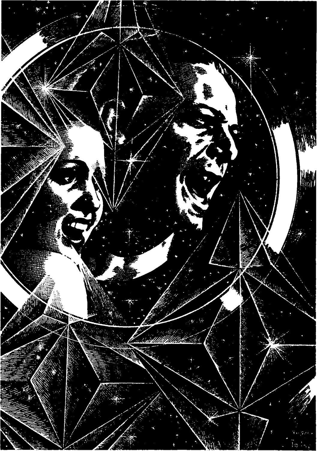
There beside Thela, Carl waited for the ripping explosion which would send them into nothingness