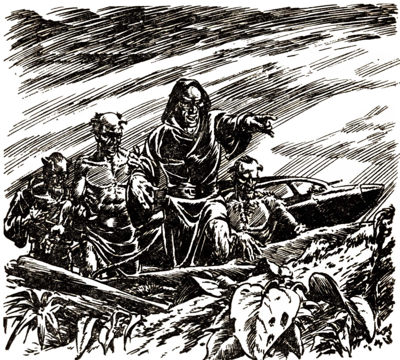
Scaly men were coming out of the strange mechanism

(Copyright, 1938, by Better Publications, Inc.)