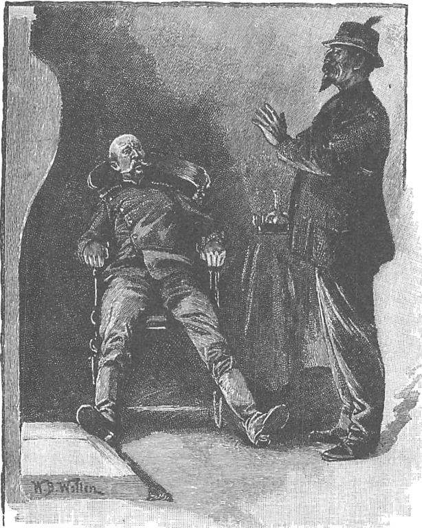
"PRAY KEEP YOUR SEAT."

"Pray keep your seat," said he. "You have no cause to trouble about your men.