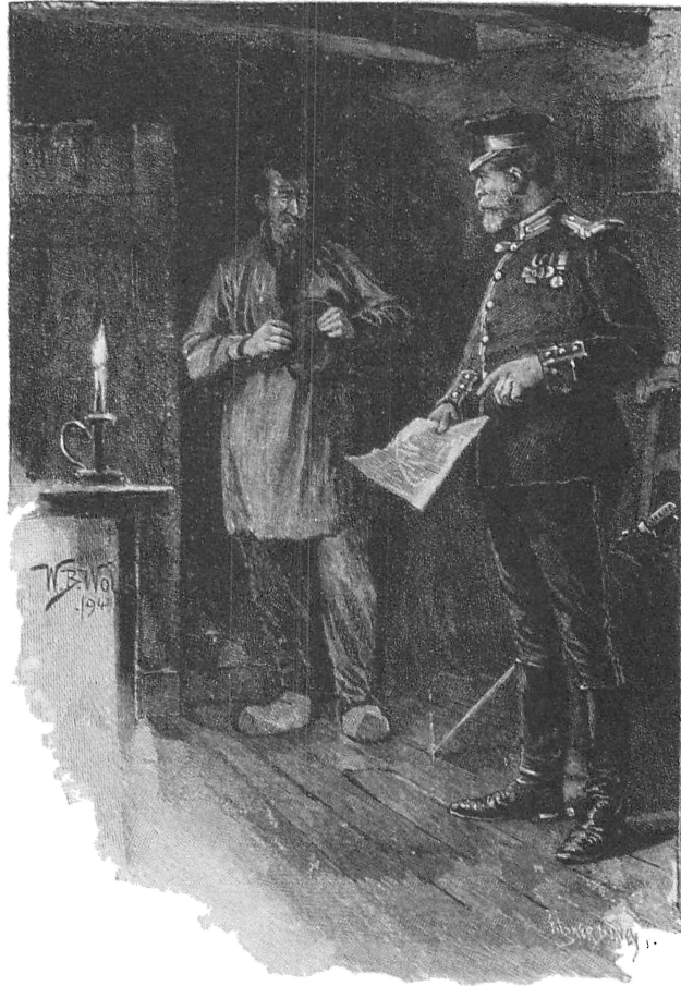
"YOU SAY YOU KNOW WHO DID THESE CRIMES?"

is he who cuts the cross upon the foreheads, for it is the badge of his house."