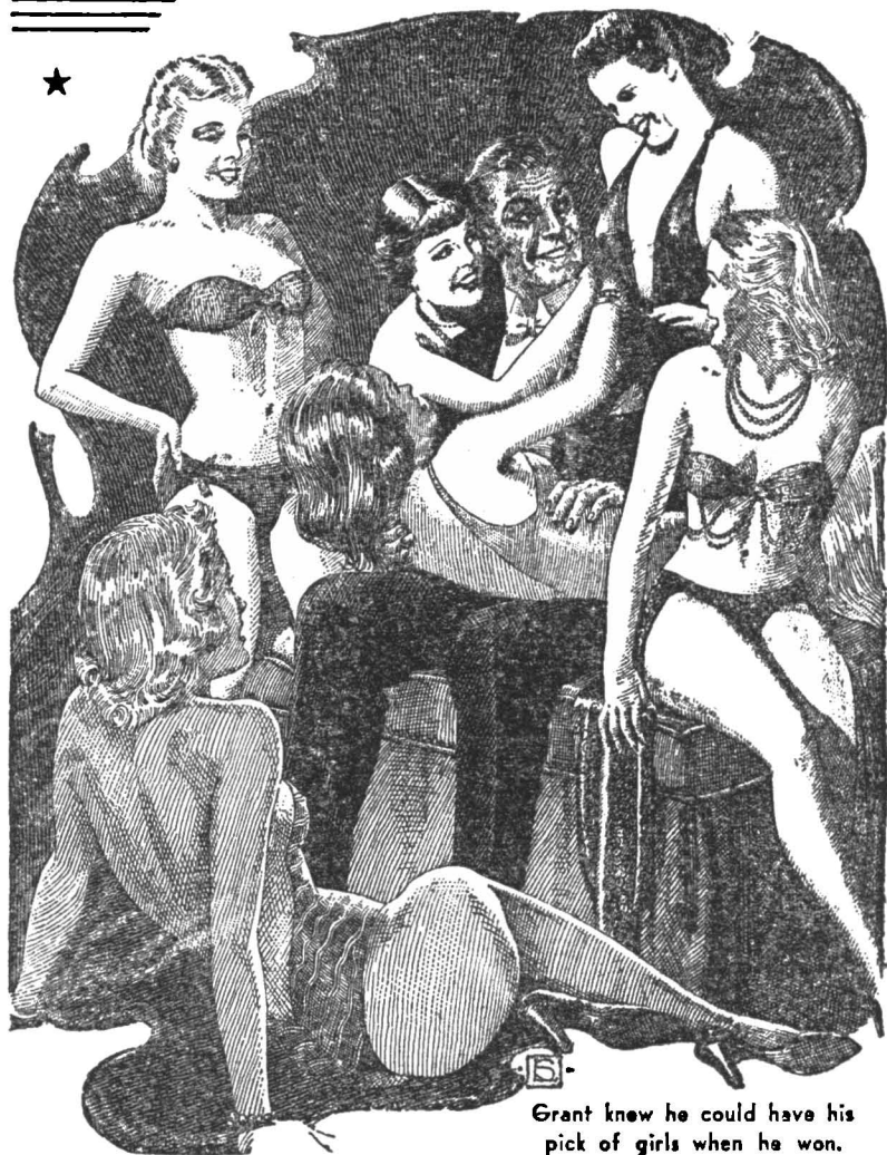
Grant knew he could have his pick of girls when he won.

"And the movie contracts, and all the rest of it? It's a little too good to be true. They usually run these things for dames, not men."