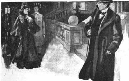
"SHE STOOD LOOKING AFTER HIM IN ALL HER OLD PROUD BEAUTY."

Shaking like an aspen, yet with a fierce joy already beginning to stir within him, Gallier crossed to his travelling valise. He drew out