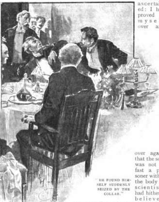
"HE FOUND HIMSELF SUDDENLY SEIZED BY THE COLLAR."

I had fully ascertained: I had proved to myself, over and