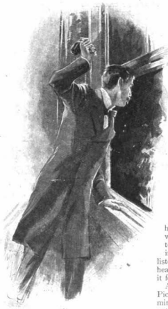
"HE THREW THE CYLINDER FAR OUT INTO THE DARK SHRUBBERY."

And now one thought alone took definite and immediate shape. The old drab, lonesome life, the old helpless, hungering years of sorrow, were ended. At last the barrier