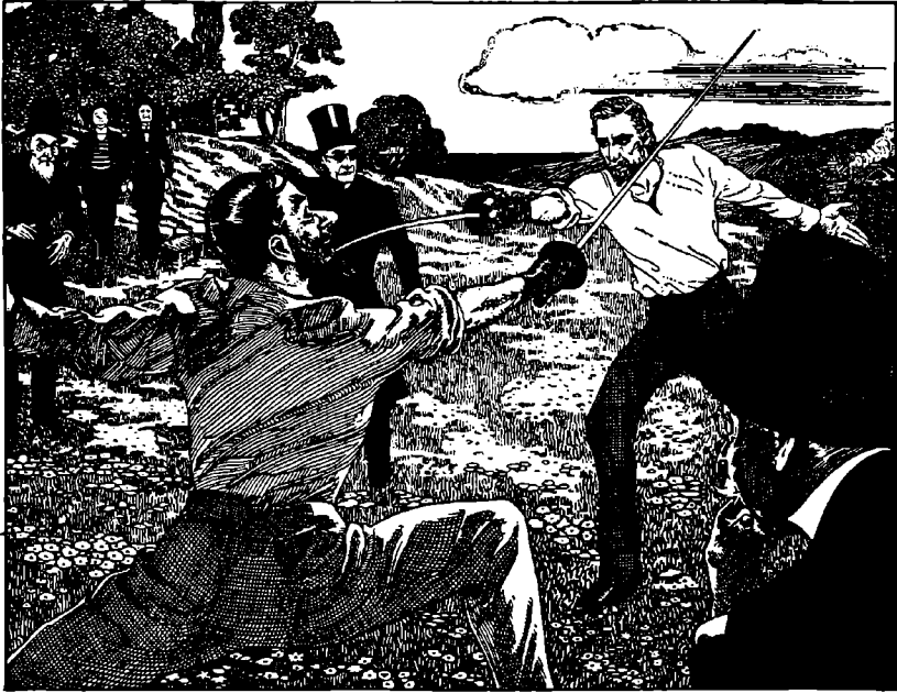
Half-mad, Syme thrust, and made what should have been a bloody scar on the Marquis's cheek. But there was no scar.

he insisted on the need for a furious and incessant energy, rending all things in pieces. Energy, he said, was the All. He was lame, short-sighted, and partially paralytic. When I met him I was in a frivolous mood, and I disliked him so much that I resolved to imitate him. If I had been a draughtsman I would have drawn a caricature. I was only an actor, I could only act a caricature. I made myself up into what was meant for a wild exaggeration of the old Professor's dirty old self. When I went into the room full of his supporters I expected to be received with a roar of laughter, or (if they were too far gone) with a roar of indignation at the insult. I cannot describe the surprise I felt when my entrance was received with a respectful silence, followed (when I had first opened my lips) with a murmur of admiration. The curse of the perfect artist had fallen upon me. I had been too subtle, I had been too true. They thought I really was the great Nihilist Professor. I was a healthy-minded young man at the time, and I confess that it was a blow.