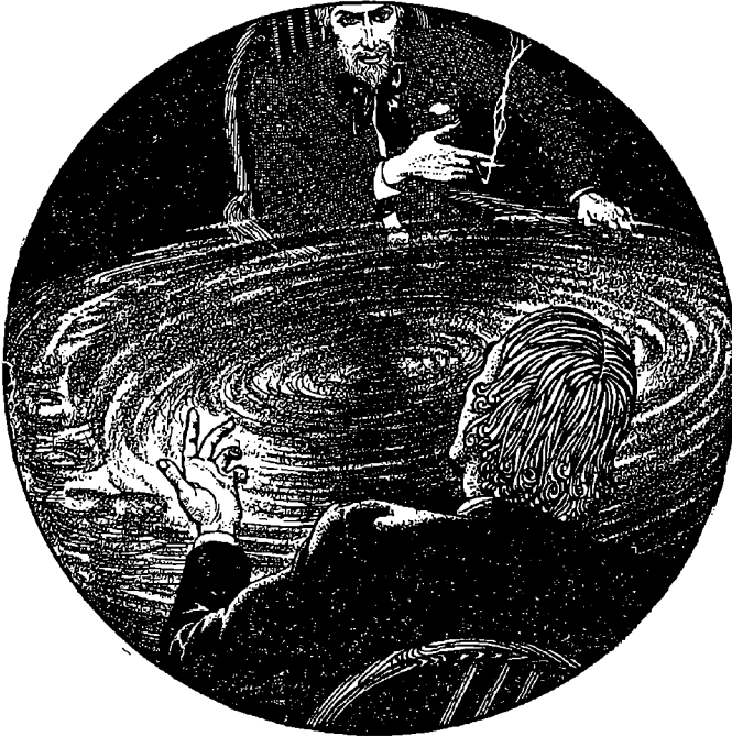
Suddenly the table began to whirl, as if at an insane séance