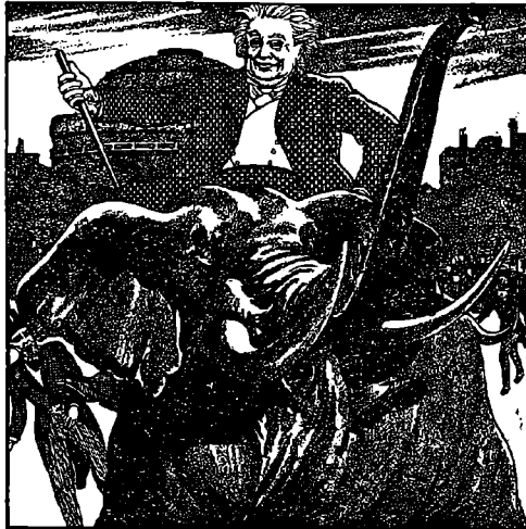
They went at such a rate that Syme saw the Albert Hall in Kensington when he thought he was still in Paddington

"We have one more chance," said Syme, taking the steel out of his mouth. "Whatever all this pandemonium means, I suppose the police station will help us. We can't get there, for they hold the way. But there's a pier or breakwater runs out into the sea just here, which we could defend longer than anything else, like Horatius and his bridge. We must defend