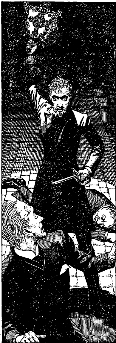
"This one old Christian lantern you shall not destroy," cried Syme in a terrible voice

the pointed steel. Syme, on the other hand, fought fiercely but still carefully, in an intellectual fury, eager to solve the riddle of his own bloodless sword. For this purpose, he aimed less at the Marquis's body, and more at his throat and head. A minute and a half afterwards he felt his point enter the man's neck below his jaw. It came out clean. Half mad, he thrust again, and made what should have been a bloody scar on the Marquis's cheek. But there was no scar.