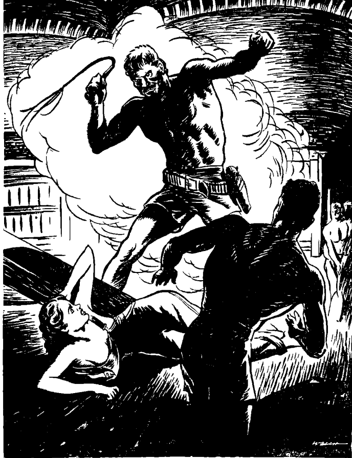
Illustration by Harold Welch. "Get up from that floor!" The brutal overseer raised his whip.