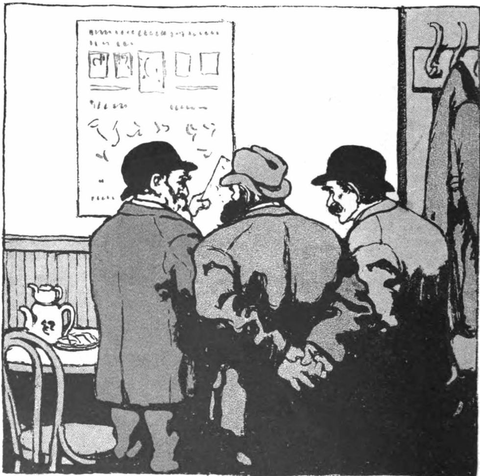
THE NEXT NIGHT, IN FUCHS'S COFFEE-HOUSE, HE CALLED ROSNOFSKY, THE BUTCHER, AND FISHLOVITZ, THE FUR-DEALER, ASIDE

All that afternoon Rosnofsky pondered. In the evening he sent for Fishlovitz. "Look here, Fishlovitz," he blurted out, the moment the latter entered the room, "how long are we going to put up with that Rosenheim business?"