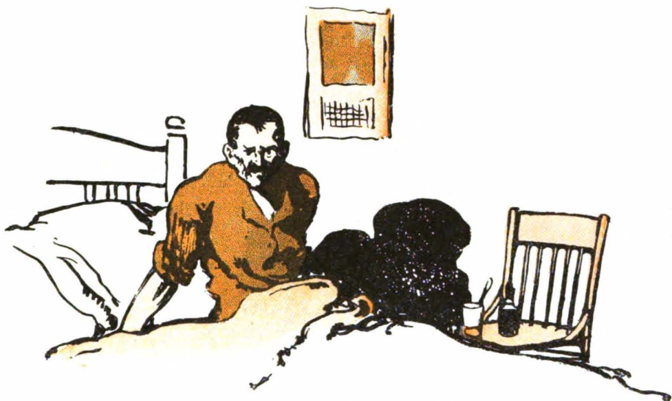
ALL THAT AFTERNOON ROSNOFSKY PONDERED