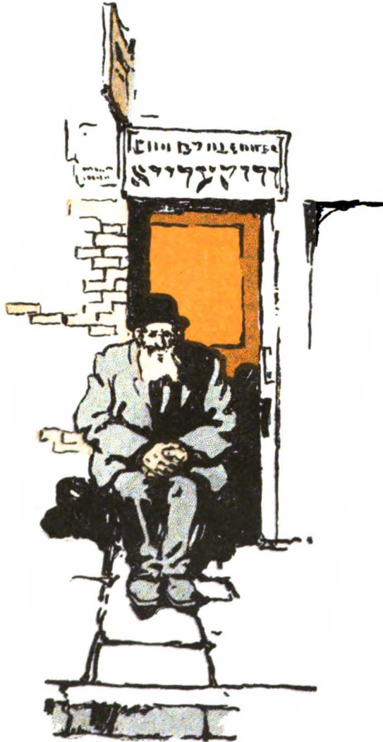
SAT IDLY IN FRONT OF HIS PRINTING-SHOP THINKING AND THINKING

"One thing I forgot," said Rosenheim on his way to Fishlovitz's house. "It must be a secret. If our friends hear of it they