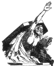
JULES VERNE'S TOMBSTONE AT AMIENS PORTRAYING HIS IMMORTALITY