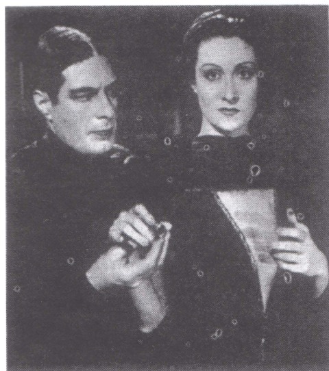
The whole story of Dracula . . . . . page 24