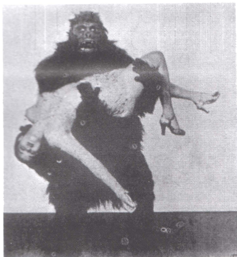
For a Who's Boo on TV . . . . . see page 18