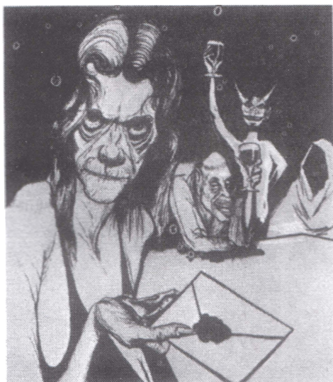
You're invited to a death feast . . . on page 30