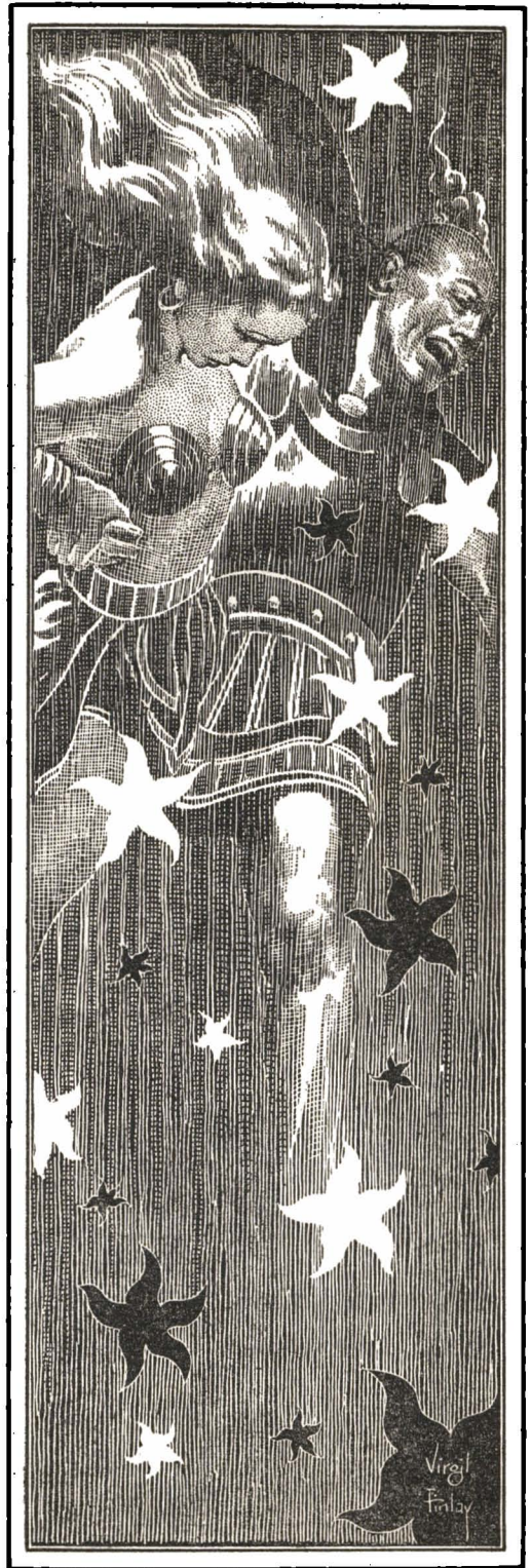
Ghostly and indistinct, Broca stood with Alor in his arms