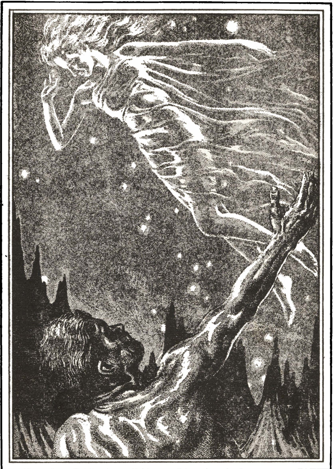
Heath looked hungrily into the mists and presently he raised his arms