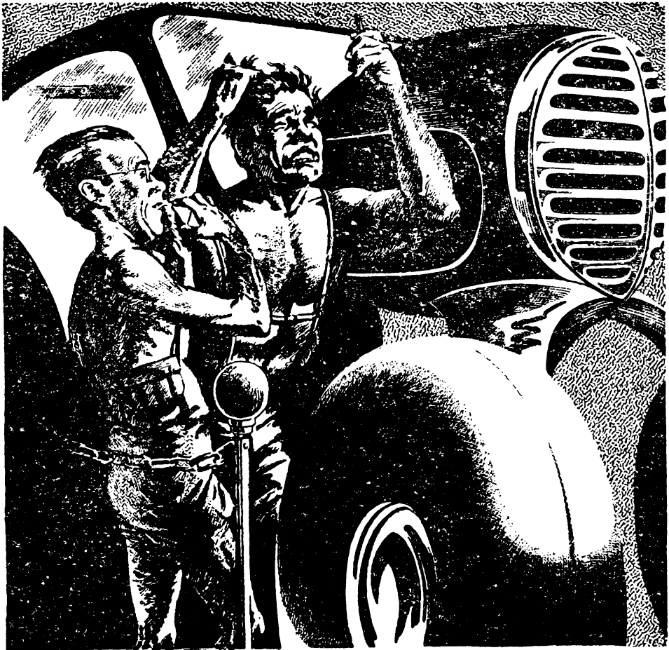
I held up that Part 2848 and tore my hair . . .

vaulted out and landed squashily in the mud.